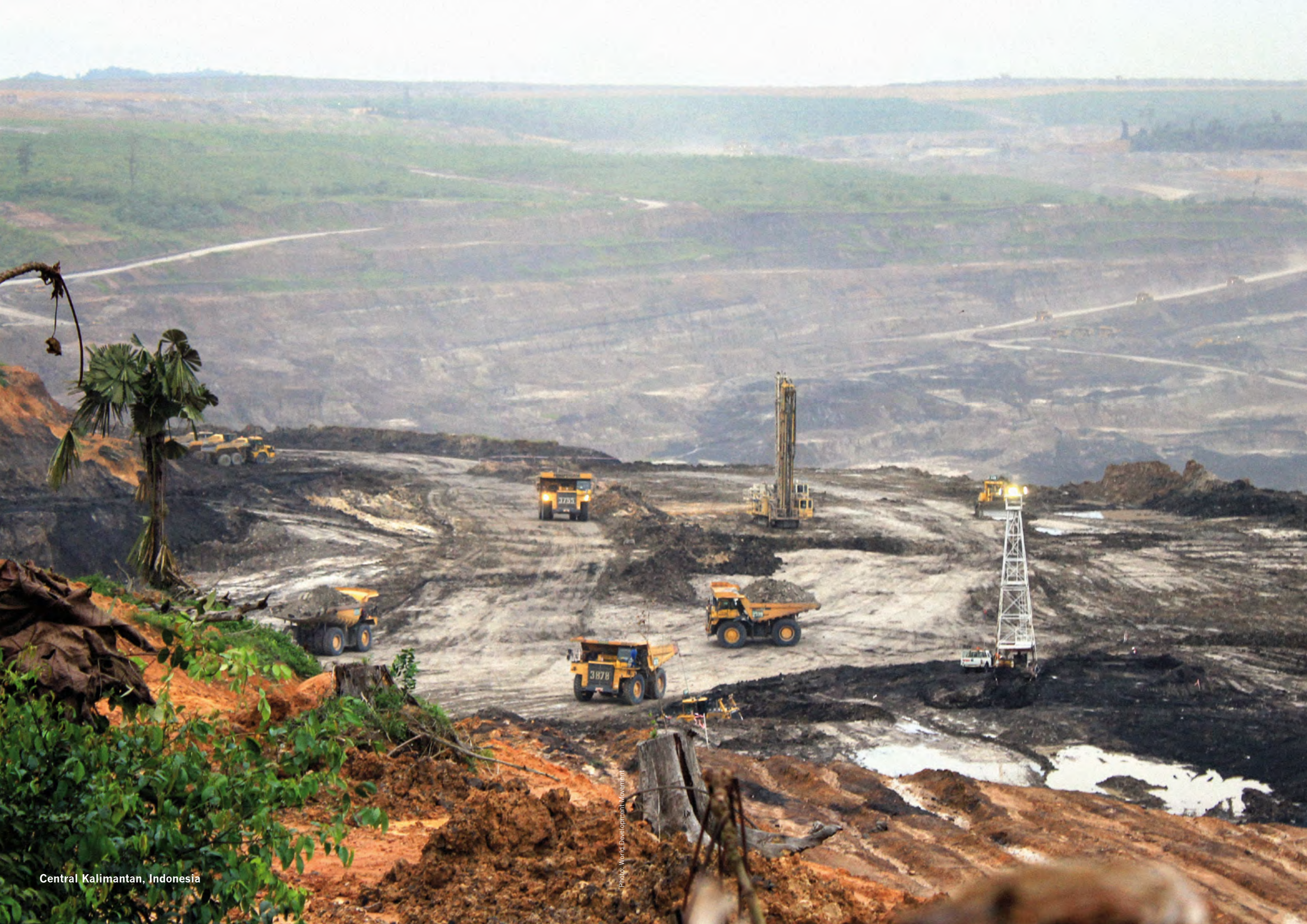
Central Kalimantan, Indonesia