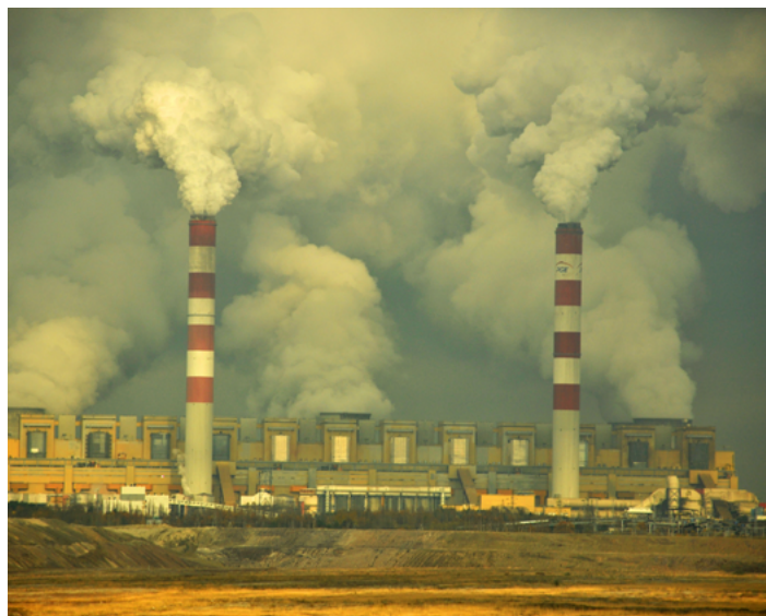
The latest BNP Paribas investment in Poland will only help keep some very big coal fires burning on.

Along with four other banks, BNP Paribas is reported