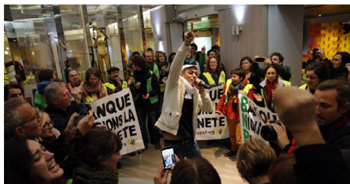
During COP21 protestors flash mob a branch of BNP Paribas in central Paris to demand the bank end its multi-billion dollar financing for fossil fuels.

Among them, will certain BNP Paribas clients be compelled to end their coal activities quickly by a certain date, for example 2020? And for how much longer will the bank continue to support major companies which nonetheless count on coal as part of their diversified portfolios?