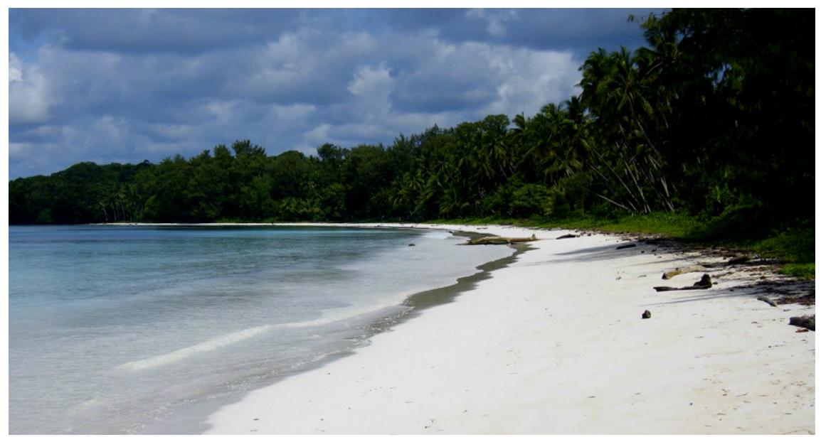
Woodlark Island, Photo: Bill Norton

tween May and June 2012. A second was planned completed in December 2012, but no details are given within the EIA which was dated January 2013. The roadshows were advertised between two and four weeks prior to the event. Four additional villages (Ungomon, Unmatana, Suloga and Boagis) were added to the original ten. It is unclear why the additional villages were added at this stage. The presentation in Kulumadau, which will be relocated, and had a population of 662 (in 2010), was the worst attended, with only 50 people, or 7% of the village population participating.