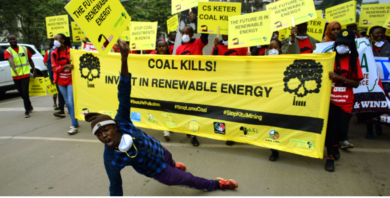
Protest against coal power and coal mining in Kenya (12. Juni 2019).

followed, the banks either got their bad loans transferred to the asset management companies or received a direct capital injection from the central government.