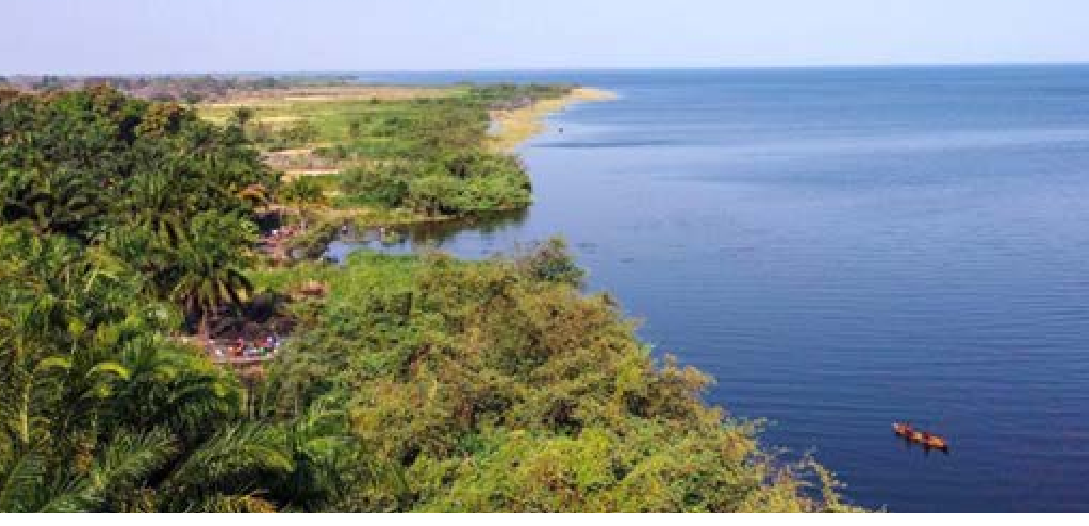
A view of Lake Upemba whose main activity is fishing and water games for the children of fishermen, July 2022