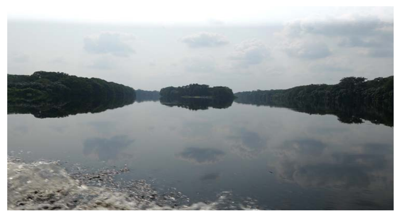
View of Maringa river near Basankusu, July 2022

Most villages are inaccessible and lack any infrastructure. The source of drinking water supply is rivers and streams, as well as poorly maintained springs. The medical infrastructure is very rudimentary and could in no way support cases of water-borne diseases, which can be expected in cases of oil pollution.