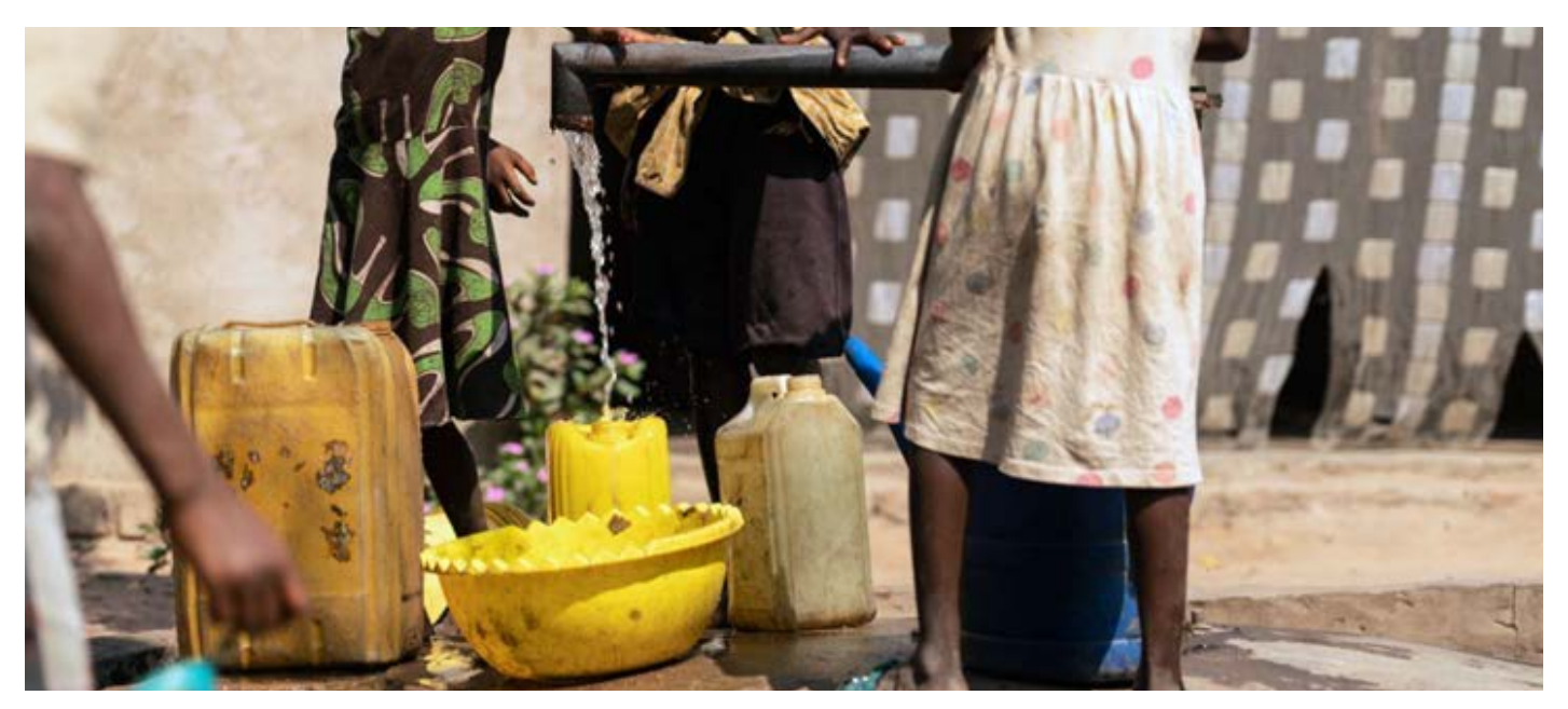
Villagers in the village of Kisungi get their drinking water from a borehole. July 2022

water other than lake water, which exposes the population to waterborne diseases such as cholera, often reported. Villages are inaccessible, with road traffic almost non-existent because of the deteriorated state of the road. Any oil spill could become a life-threatening calamity, poisoning local communities only water resources.