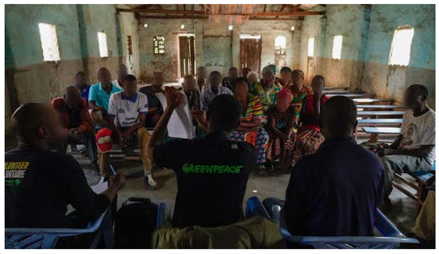
Batches of salted and dried fish, compacted in basins for the local market and imports, in the village of Missa near Lake Upemba. July 2022

Batches of salted and dried fish, compacted in basins for the local market and imports, in the village of Missa near Lake Upemba, July 2022