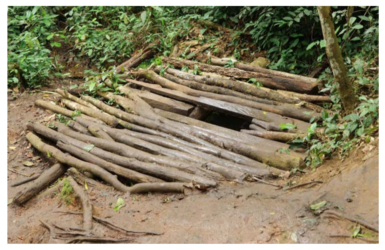
Water source in the village of llebo, July 2022

People use everything nature offers them. The largest means of transport used in the area visited are canoes, motorbikes and most people walk to reach certain activity centres.