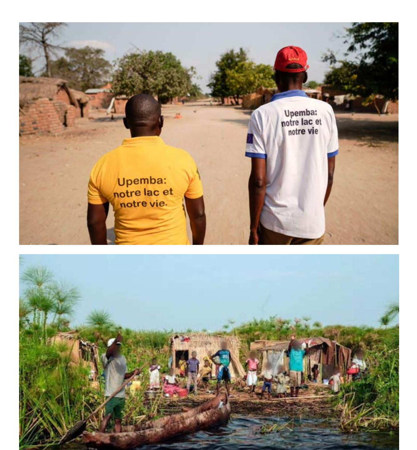
The dwellings of itinerant fishermen on the shores of Lake Upemba, July 2022

The lake is also part of their core cultural heritage: it serves as an important site for the initiation of children – boys and girls from the age of four – to the practice of fishing.