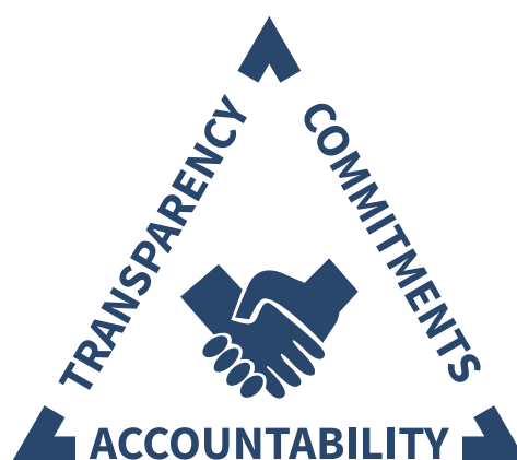
The accountability triangle; adapted from Oxfam. 36

Transparency of lending relationships is also vital for accountability and the effective functioning of grievance mechanisms. Oxfam Australia has talked of transparency as part of a mutually reinforcing ‘responsibility triangle’, alongside commitments and accountability, with accountability as central to good governance. 33 Banks, like all businesses, have a responsibility set out in the UN Guiding Principles on Business and Human Rights to “establish or participate in effective operational-level grievance mechanisms for individuals and communities who may be adversely impacted” by their operations. 34 As we have pointed out in a briefing paper written with Oxfam Australia, it is difficult to imagine how a grievance mechanism for people impacted by bank-financed activity can operate effectively without information on corporate loans and project finance being available to those impacted. 35