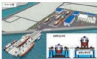
Architectural rendering of the new shipyard

The shipbuilding industry in Kesennuma-shi, Miyagi Prefecture suffered catastrophic damage during the March 2011 earthquake disaster, with facilities destroyed by the tsunami, and ground subsidence in shipyard sites. The recovery of Kesennuma, one of the main marine products cities in Japan, is essential to the revitalization of the shipbuilding industry. Miraships, comprising mainly four shipbuilding companies damaged in the disaster, was established to strengthen the business foundation for the shipbuilding industry in Kesennuma, and construct a shipyard with cutting-edge facilities at a new site.