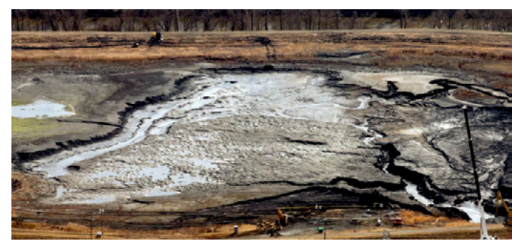
A coal ash pond next to the Dan River ruptured in 2014 causing 112 kilometres of toxic river sludge. The criminally negligent culprit, Duke Energy, remains one of UBS's top coal clients.

No matter how it might attempt to wriggle out of its responsibility for Duke's repeat attacks on the environment and public health, UBS's $1.3 billion input has contributed to these atrocities. The bank simply has to stop financing Duke Energy, and now.