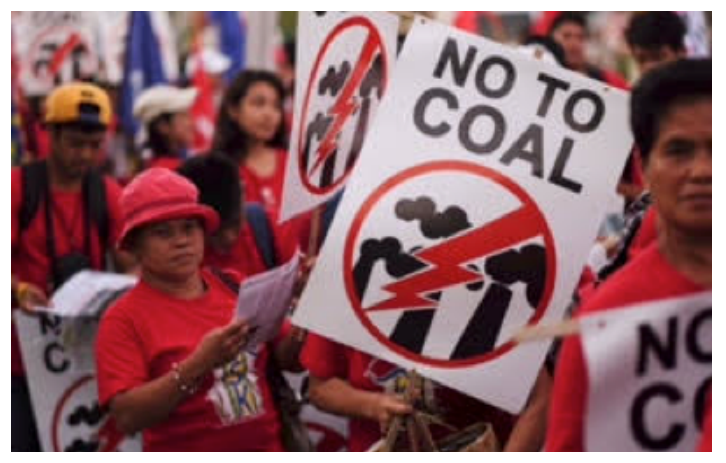
A large number of proposed coal plant and coal mine projects in the Philippines are provoking huge opposition across the country

In the Philippines and elsewhere, UBS must stop financing companies which have more than 30% of their business tied to coal or mining, or which burn more than 20 million tons of coal per year.