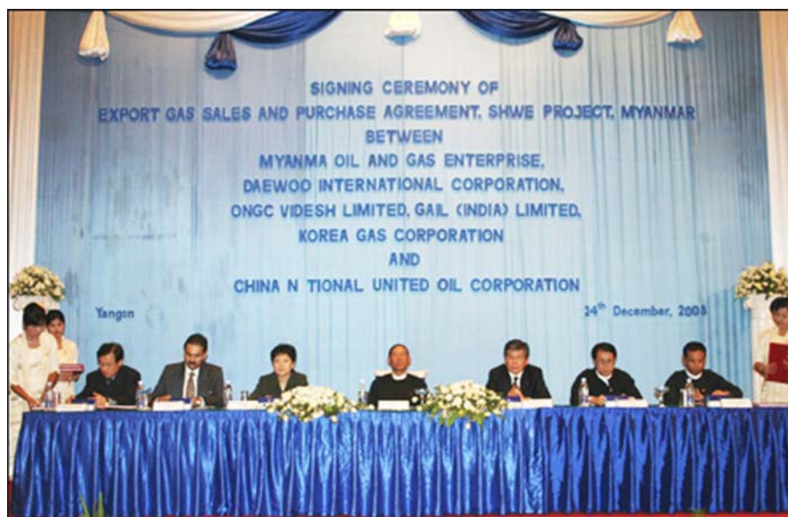
People attend a signing ceremony for a gas sales and purchase agreement with the Shwe Project by the China National United Oil Corporation (CNUOC), Myanmar, and a consortium led by South Korea’s Daewoo International in Yangon, Myanmar, Dec. 24.

The news release said, “Daewoo International and the KOGAS have breached and will continue to breach a