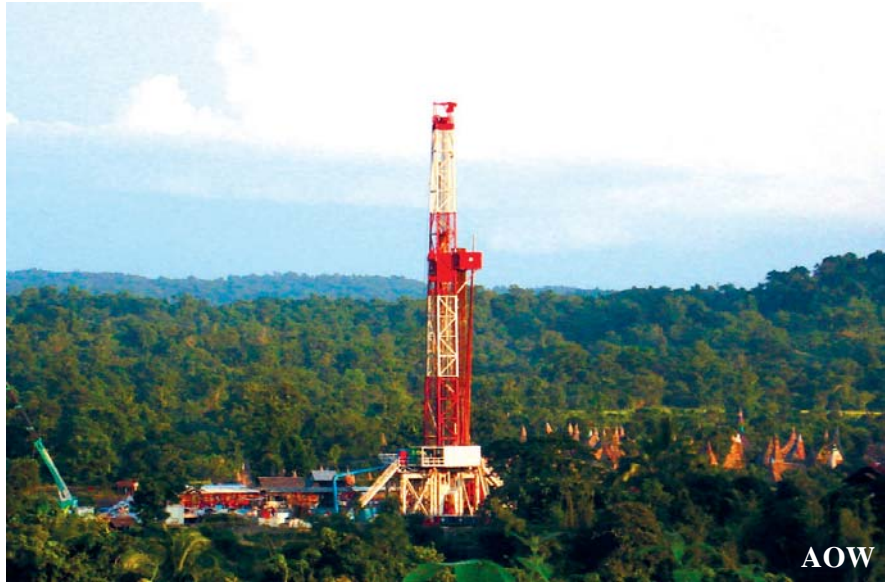
CNOOC's drilling site in Renandaung Village, Kyuk Phyu Township, Ramree Island.

Concerns about the cost of letting China tighten its grip on the natural resources in Myanmar has also been expressed by other groups, including EarthRights International (EI), a US-based group championing human rights. There are 69 Chinese companies involved in 90 "completed, current and planned projects" in the oil, gas