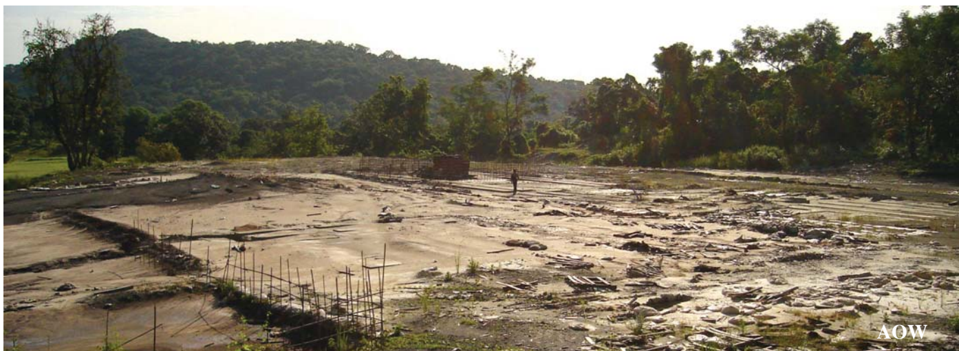
Land that was confiscated for CNOOC's drilling site in Laydaung, Ramree Island.

management, such projects are likely to cause environmental problems, the [CAEP] report said.”