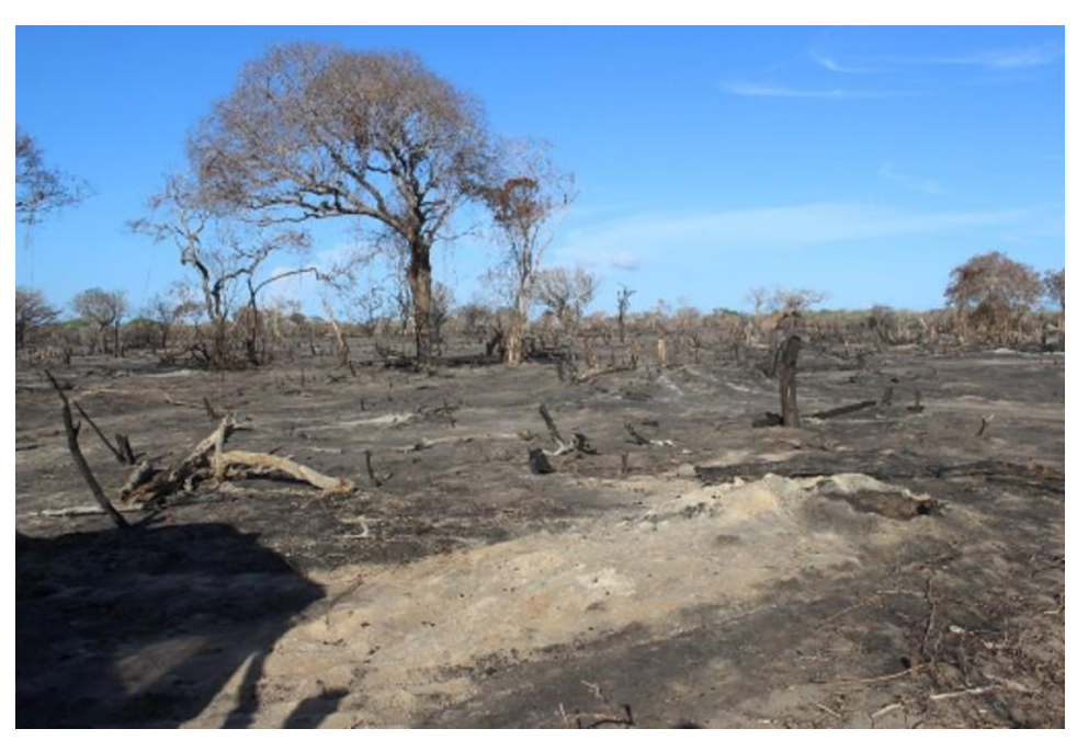
Picture 15: Some of the ongoing destruction of forests by people speculating due to LAPSSET

Development that affects the marine waters will have a negative impact on sustaining marine animals. The disturbance and destruction of the coastal ecology will affect the fish and shellfish that depend upon the mangrove for their nutrients and habitat, and thereby our fishing activities.