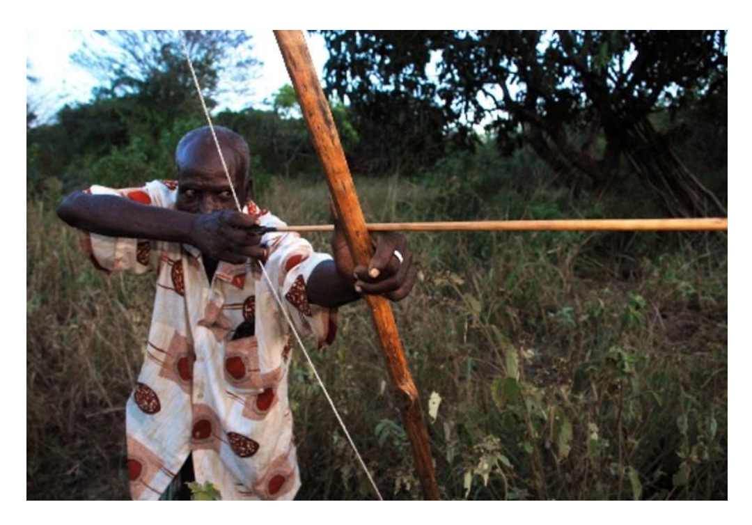
Picture 7: Aweer elder showing how they used to use arrows to hunt for wild animals