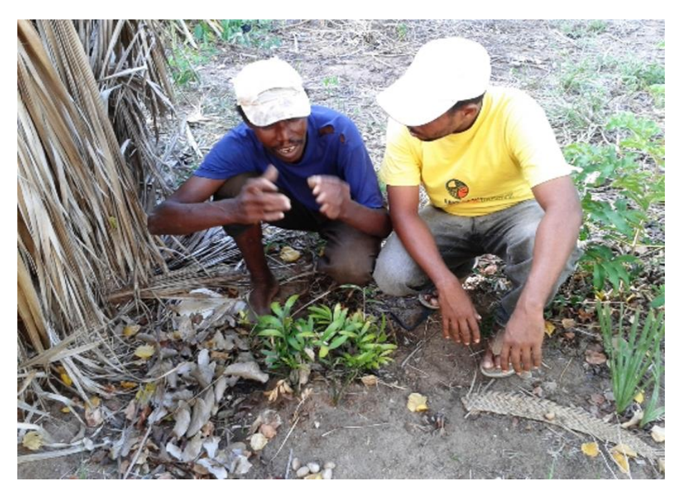
Picture 6: Sanye community member explaining how they used to hunt in the past

We don't have land security. Our lands are continually being grabbed from us by wealthy elites and government agencies. We want our community lands recognized so that our people have a future and our rights to preserve our culture and way of life are upheld.