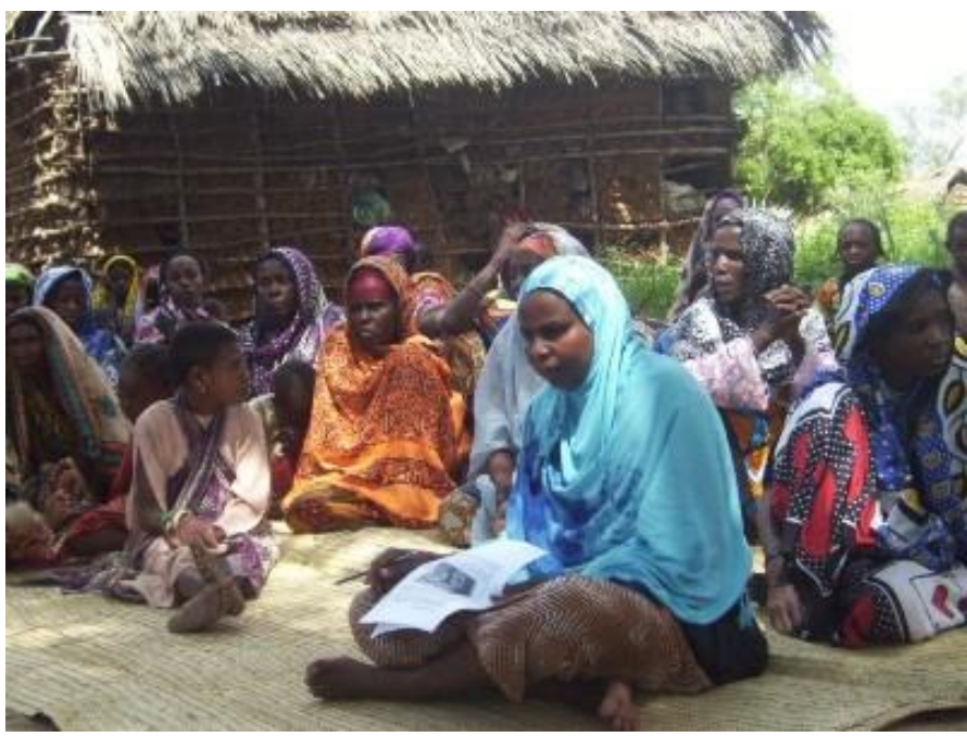
Picture 2: Community members pay attention during one of the BCP meetings

Our concerns were first set out in the Fort Zahidi Ngumi Declaration of 2009 following announcement of the development of a new transport corridor in the hope that the Lamu BCP would help to guide the planning of development projects and the use of natural resources in order to maintain our cultures and traditions and sustain the environment that we have protected for centuries. Realistically, this is the only way to profit from development, create economic stability for our local communities to provide benefits to the national society while also maintaining the historical importance attached to the resources by our communities.