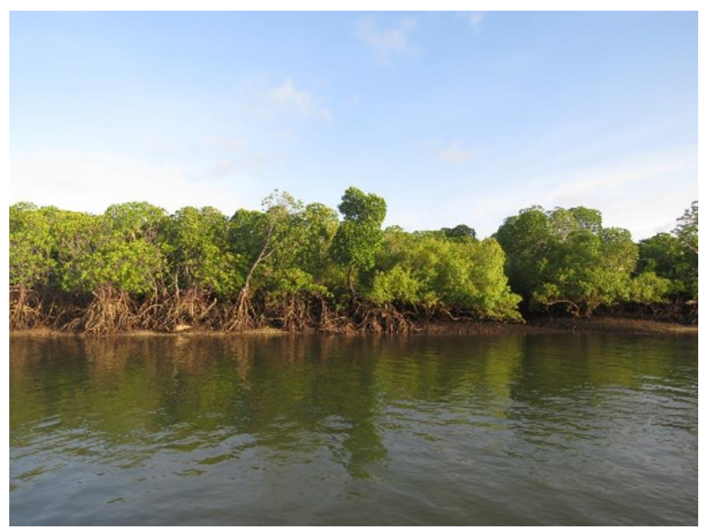
Picture 9: Lamu County has the highest mangrove concentration in Kenya

There are several types of mangroves in our area: These include "mkoko" "mwia", "mkandaa", "mlilana", "mutu", "ntu", "kikandaa" and "mkomafi". Each of these varieties has a purpose and a time for cutting them. Our mangrove forests in the County are healthy and well preserved spanning 37,350 hectares, which makes up almost 61% of the mangrove in Kenyan, 3% of forest cover<sup>16</sup>, and more than half of the total forest coverage in the County. These forests are the best preserved and healthiest on the whole coastline of Kenya.