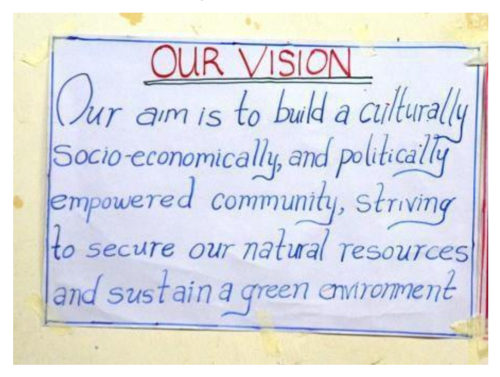
Picture 17: Joint vision created by BCP participants from Lamu County

"To build a culturally, socio-economically, and politically empowered community, striving to secure our natural resources and sustain a green environment."