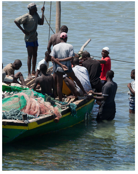
Fishermen, Lamu County