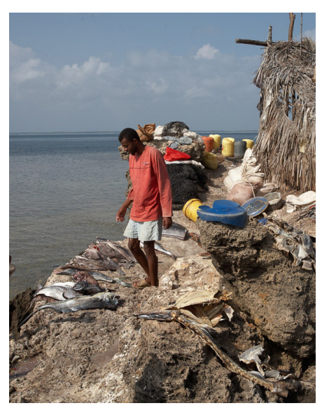
Drying Fish, Lamu, © Michel Laplace-Toulouse

systems and crops, plants and trees, and affect fish and wildlife. As noted in the ESIA, there are two national parks and numerous critical land and marine habitats in the zones identified as most affected by emissions from the plant. Myllyvirta and Chuwah found that "total acid deposition on land is projected at 8,000 tonnes SO2 equivalent, of which 24 per cent or 2,000 tonnes into critical and legally protected areas".