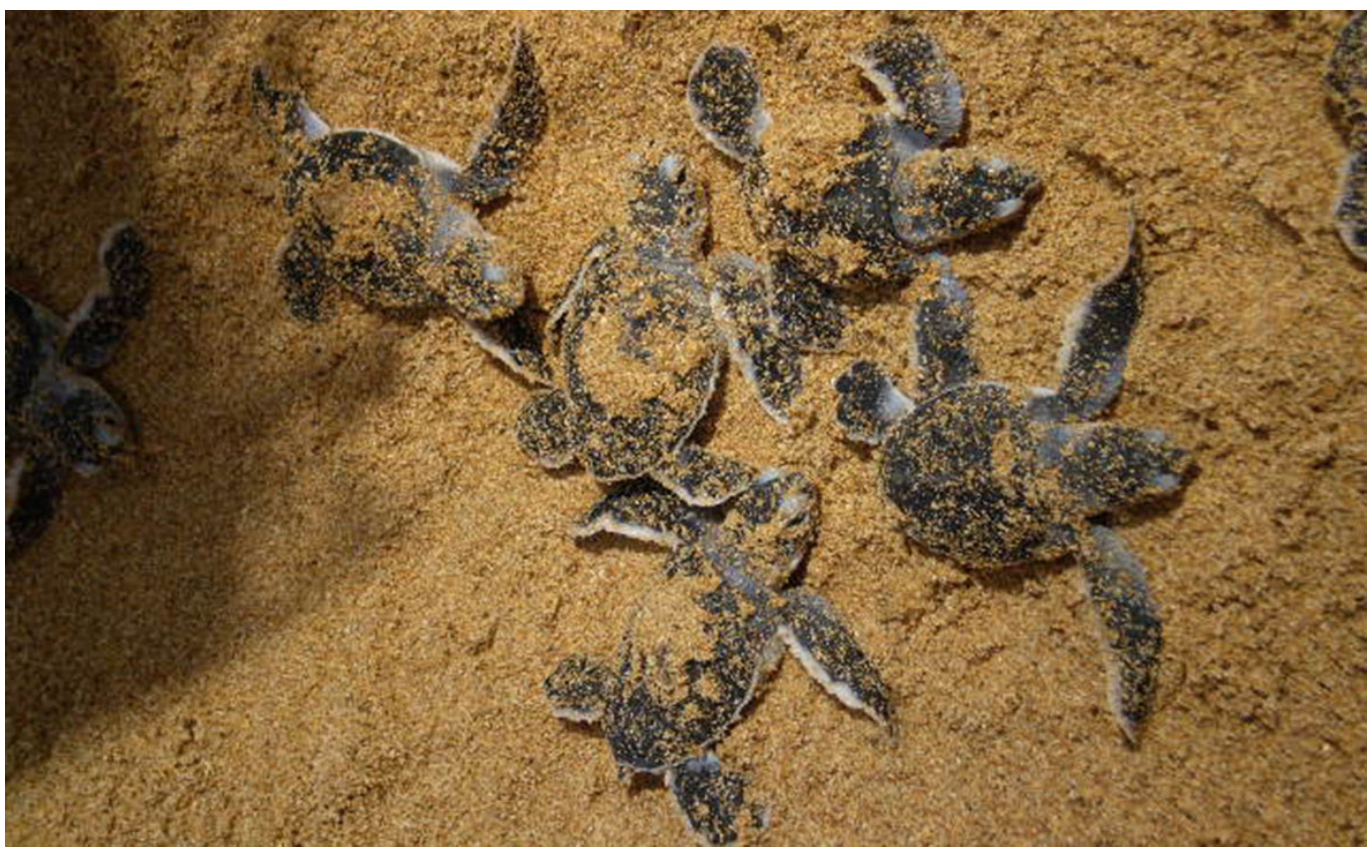
Sea Turtles Hatching

The lives, livelihoods and culture of the Swahili and other peoples of Lamu are interwoven with their environment. It is impossible to discuss the impacts of coal combustion on the environment without also talking about the impacts on the community. Community members are concerned about how the plant will affect their lives and if there are any ways their environment, health and livelihoods could be protected if Amu Power goes ahead with the plant.