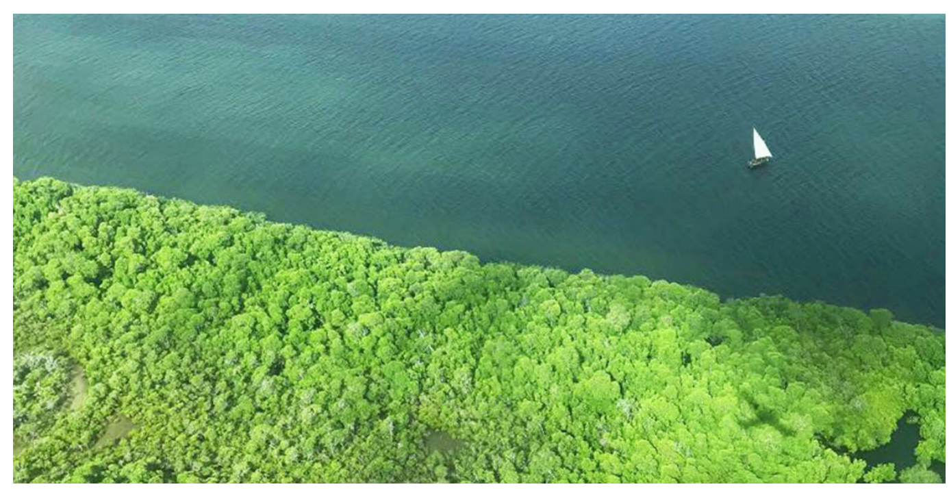
Mangroves, Lamu County, © Sara Duboys

The plans for this plant not only go against the recent trend in international divestment from coal and coal-fired generation, but also ignore the fact that the plant is not necessary to meet current or projected electricity demand. Historically, the growth rate for electricity use in Kenya has hovered around 6 per cent. Lahmeyer International, an independent engineering consultancy that prepared the Power Generation and Transmission Master Plan for Kenya's Ministry of Energy and Petroleum, projects electricity consumption in Kenya to grow, on average, by 8 per cent annually through 2030, with a peak load in 2030 of 4,700MW. The plans for the Lamu Plant were adopted based on an anomalous projected demand growth of 15 per cent and a peak demand in 2030 of 10,000-15,000MW.