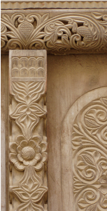
Carved Door with Traditional Motifs, © Save Lamu