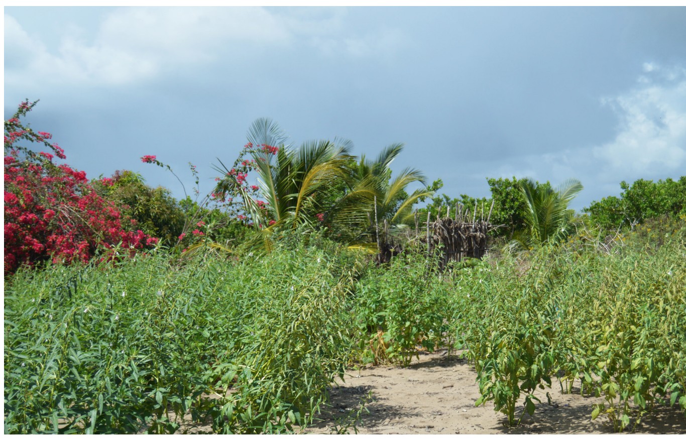
Simsim (Sesame) Farm, Kwasasi, © Omar Elmawi

Releases from coal combustion plants – in the form of gases, liquids and solids – have been proven to damage human health. In the case of the Lamu Coal Plant, air "emission limits applied to the project are alarmingly weak in international comparison. For example, the plant would be allowed to emit 5-10 times as