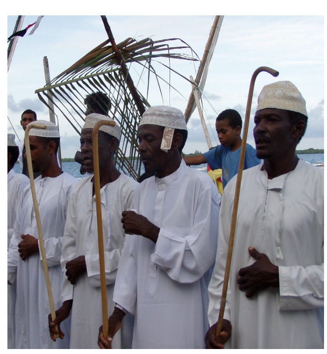
Traditional Dancers, Lamu Cultural Festival (Ngoma)

The proposed Lamu Coal Power Plant will exponentially increase the already significant risks posed by LAPSSET to the health and livelihoods of the people in the region, the ecosystem, and to Lamu Old Town World Heritage Property.