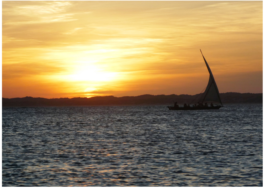
Dhows at Sunset, Manda Bay

About the author: This report was written collectively by members of deCOALonize. DeCOALonize is a collaboration of environmental and social justice advocates who want Kenya to have a green economy powered by sustainable and clean renewable energy. Partners consist of individuals and organizations from Kenya, South Africa, Australia, Europe and the United States of America. For additional information, visit www.deCOALonize.org