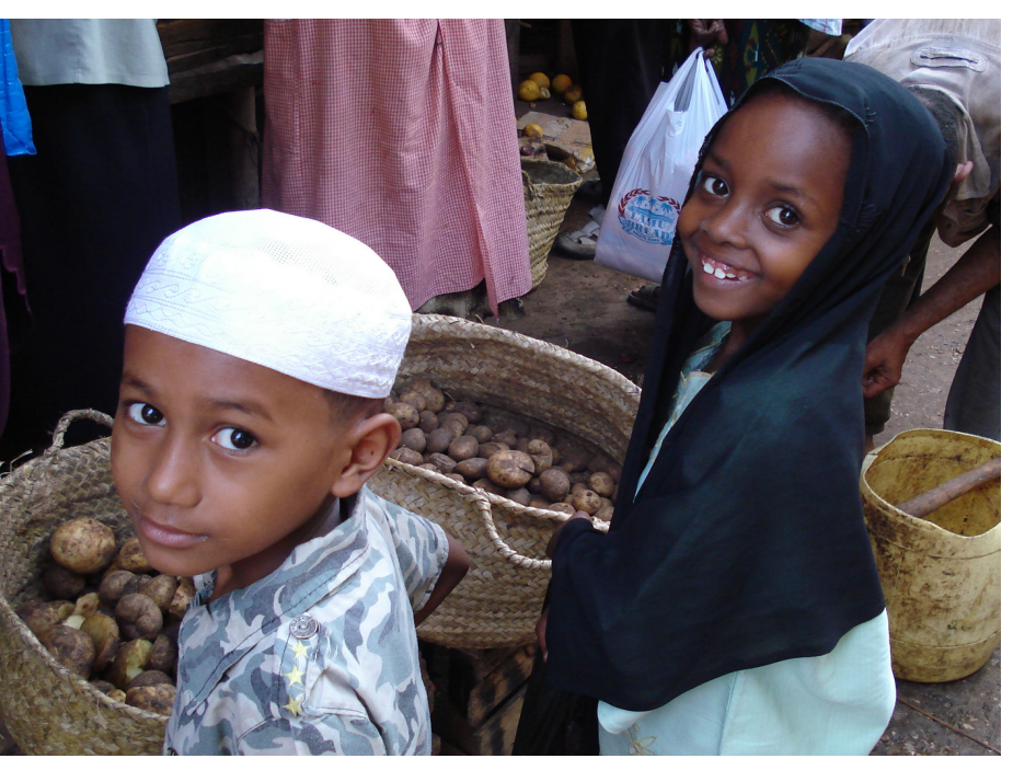
Lamu Children