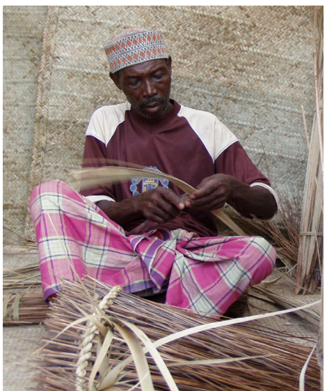
Fishing trap