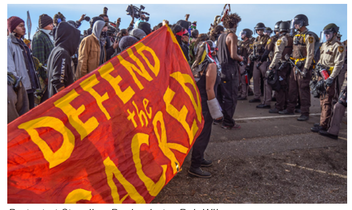
Protest at Standing Rock

That's why it is urgent for Société Générale to learn all the lessons from the Dakota Access Pipeline and commit to not finance further pipelines or LNG terminals in the country.