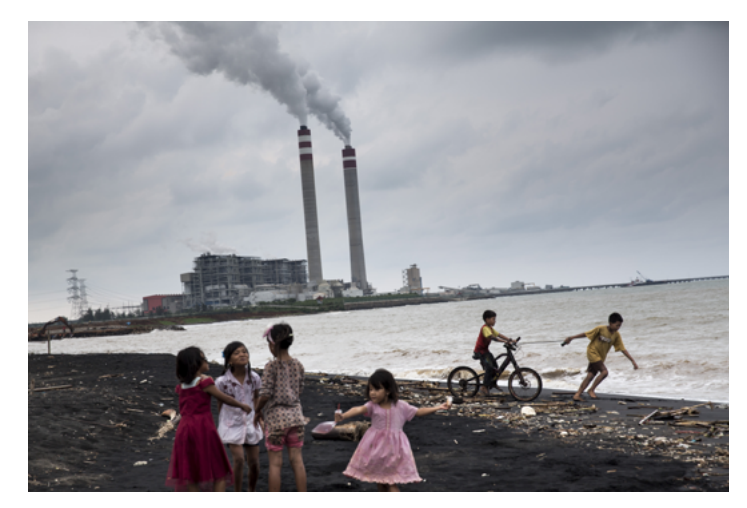
Children playing on the beach near the Tanjung Jati B in central Java.

Given this state of affairs, last year Greenpeace commissioned Harvard University to carry out a detailed report on the health impacts of air pollution from coalfired power plants in Indonesia. The research's key warning is that if Indonesia pursues its current plans