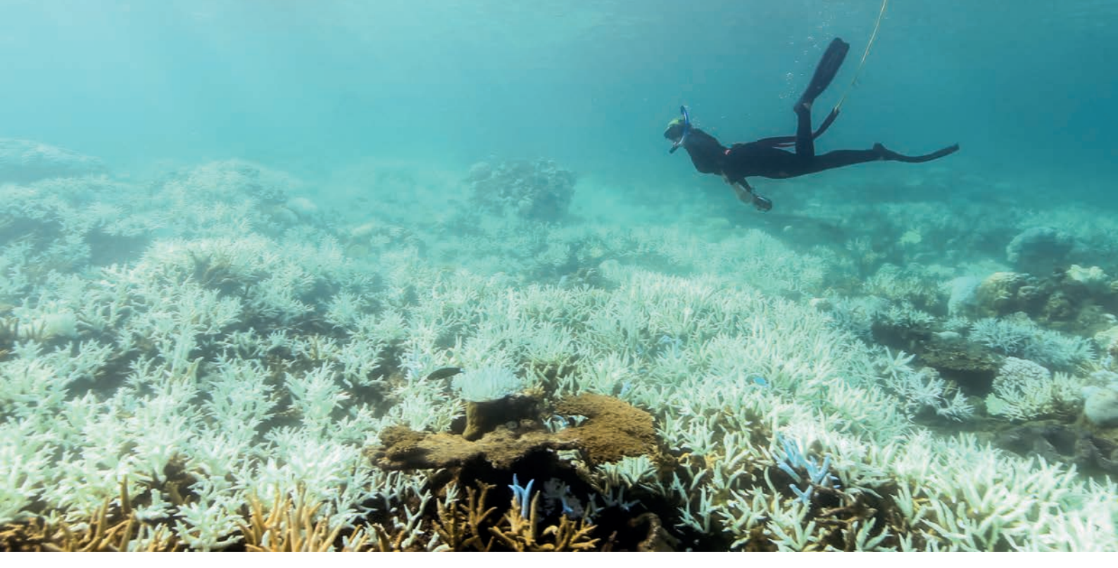
Figure 12: Bleached coral (white) and dead coral covered in algae (brown) at Port Douglas, on the Great Barrier Reef in March 2017.