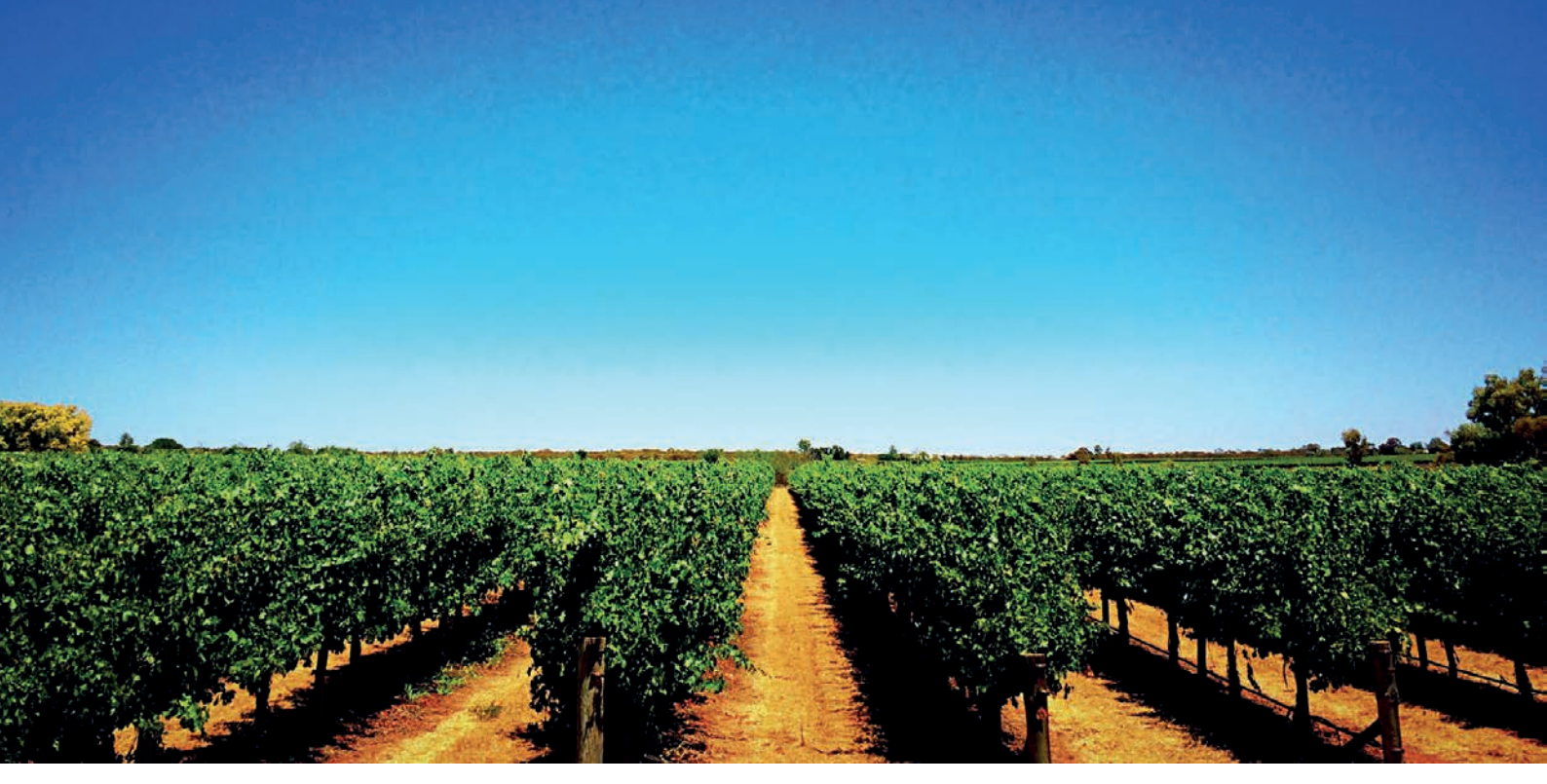
Figure 11: Australia's wine industry contributes significantly to the Australia economy, but viticulture is highly sensitive to changes in the climate.

Because 90% of groundwater extraction is used in agriculture (Tan et al. 2015), one of the major areas of contention between farming and mining is the impact on aquifers (Lawrence et al. 2013; Tan et al. 2015). Community concerns have resulted in Federal and State governments agreeing to tighten regulations that protect aquifers and limit pollution (Lawrence et al. 2013).