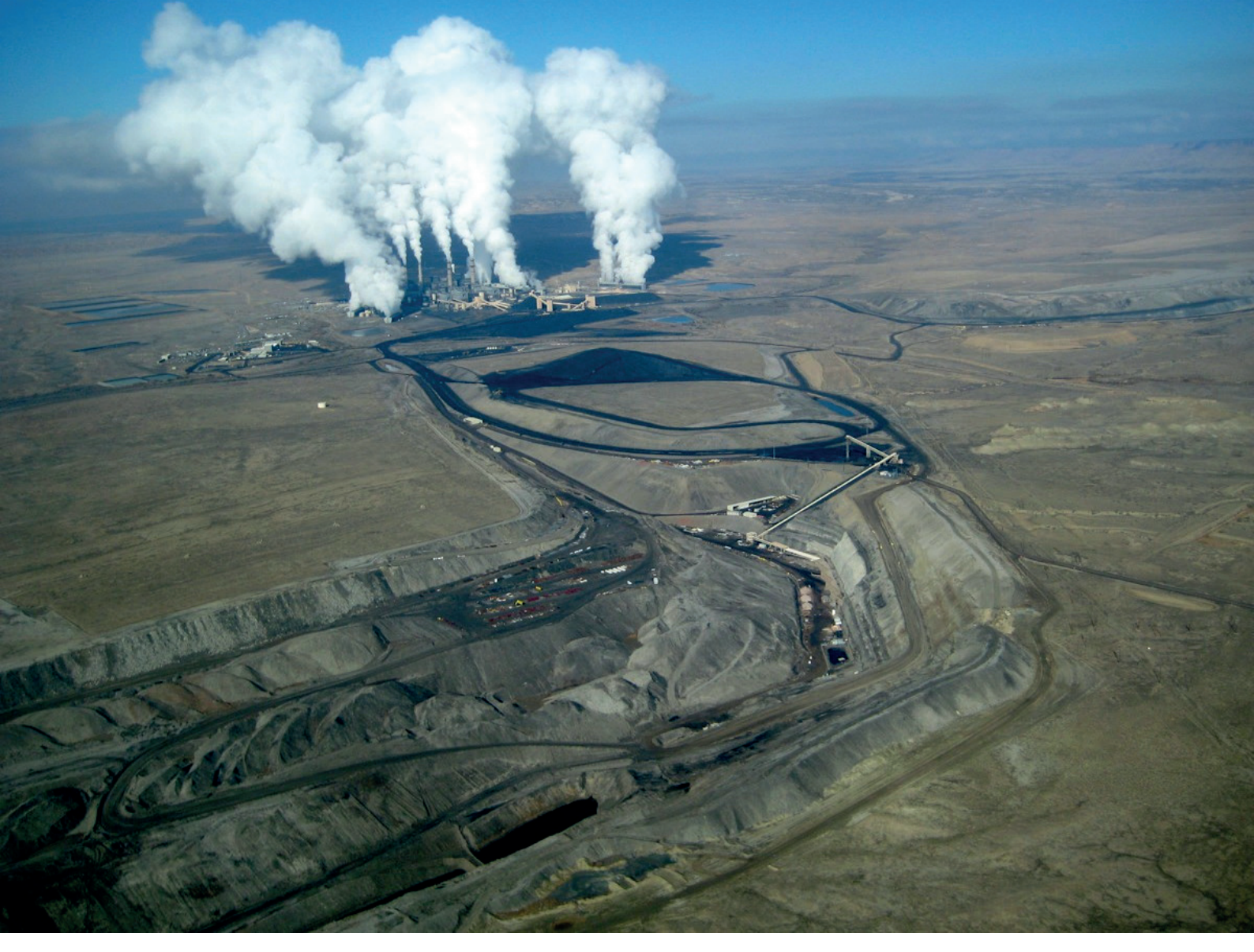
Figure 2: San Juan generating station and coalmine in New Mexico. The more CO_2 emitted into the atmosphere, the more the Earth warms.

There is a direct relationship between our emissions of CO<sub>2</sub>, primarily from the burning of fossil fuels (Figure 2), and the rise in global average temperature (IPCC 2013). The more CO<sub>2</sub> we emit, the more the Earth warms. So, to limit warming to no more than 2°C, there is a limit to how much CO<sub>2</sub> we can emit. That is, there is a global carbon budget for the amount of fossil fuels we can burn. The global carbon budget provides a framework for understanding how much fossil fuels we can burn to have a good chance of staying below a 2°C rise in global temperature. While no amount of global warming is entirely 'safe', the budget approach can assist in planning the speed and scale of the transition away from fossil fuels.