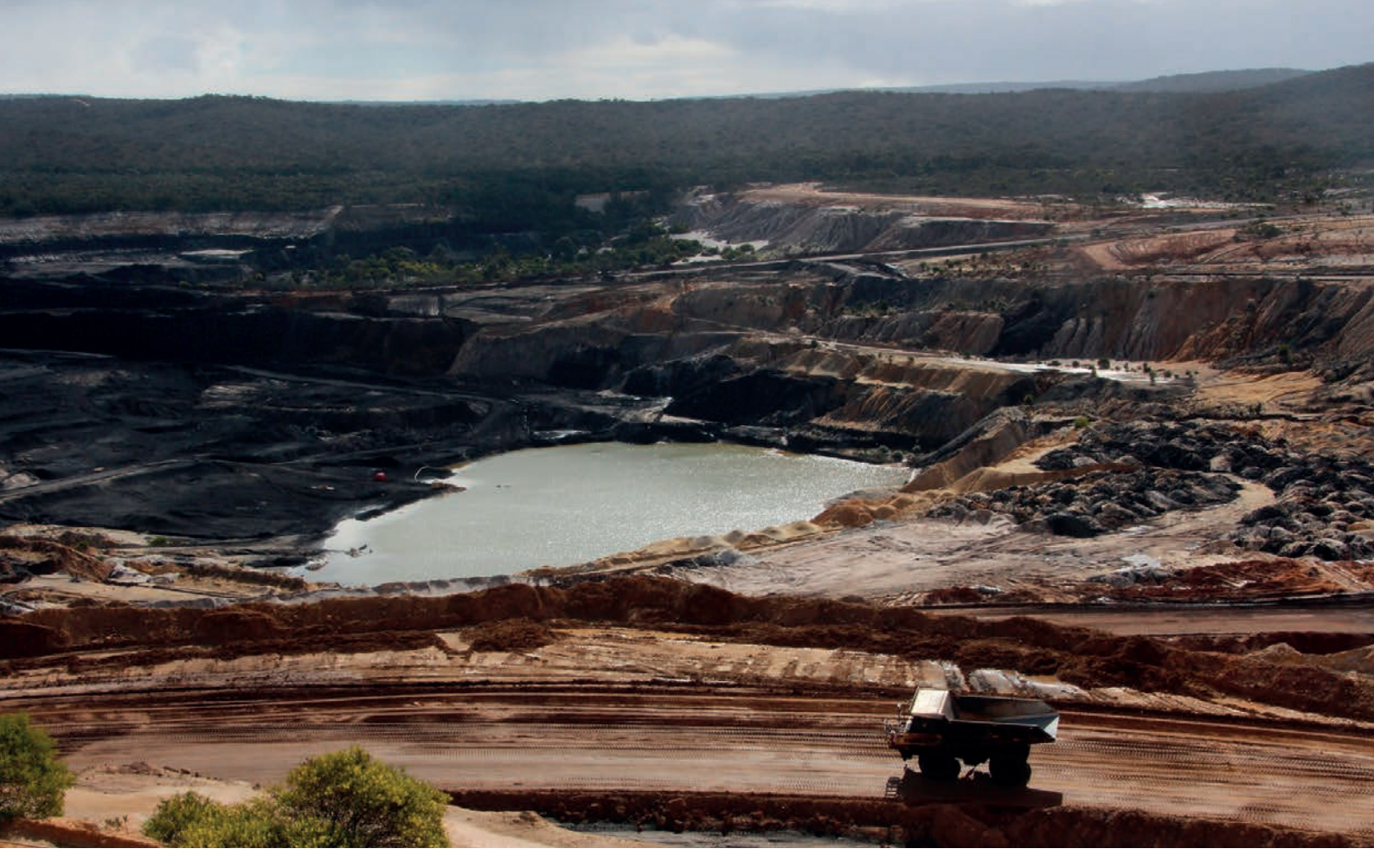
Figure 9: Stranded asset. Anglesea coalmine in Victoria closed in 2016 after the coal plant owner Alcoa was unable to find a buyer for the power station (RenewEconomy 2015).

Recognising the risk of stranded assets as the world transitions to a low carbon economy, investors are moving away from putting money in fossil fuel assets, that is, they are 'divesting' (OECD 2015). It is estimated that investors engaged in divestment managed a total of US$50 billion in assets in 2014 and by early 2015 this figure grew to US$2.6 trillion (Arabella Advisors 2015). By December 2016, it is estimated that the value of assets of institutions and individuals committing to divestment from fossil fuel companies was US$5 trillion (Figure 10). One year on from the Paris climate agreement, 688 institutions and 58,399 individuals across 76 countries have committed to divest from fossil fuel companies, doubling the value of divested assets represented in just over a year (September 2015 - December 2016; Figure 10). Pension funds and insurance companies now represent the largest sectors committing to divestment, indicative of the growing financial risks of having fossil fuel investments in a world committed to staying below 2°C global temperature rise (Arabella Advisors 2016).