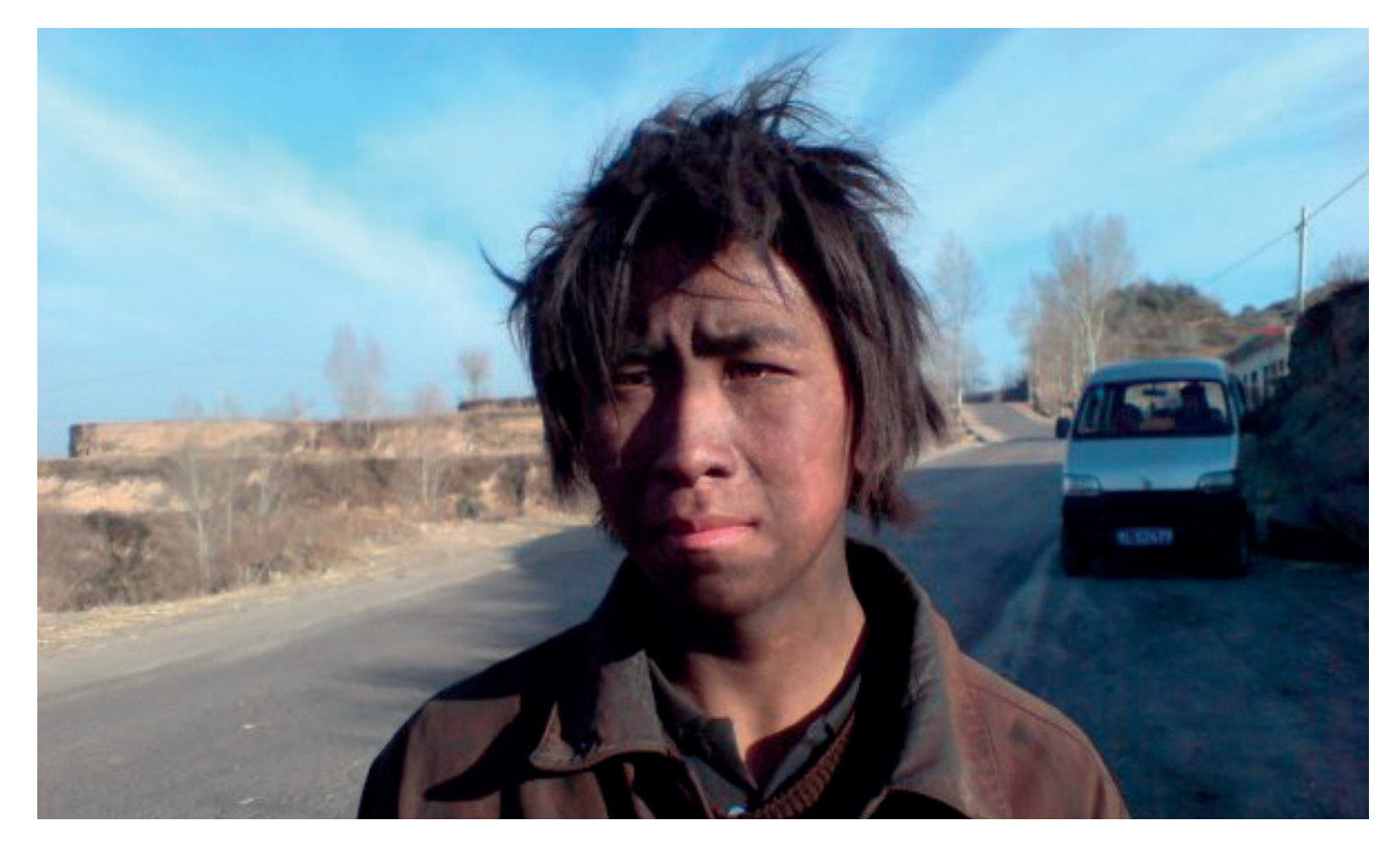
Figure 13: A young coalminer in China. Miners, workers and local communities can suffer serious health consequences from coalmining (e.g. Castleden et al 2011).