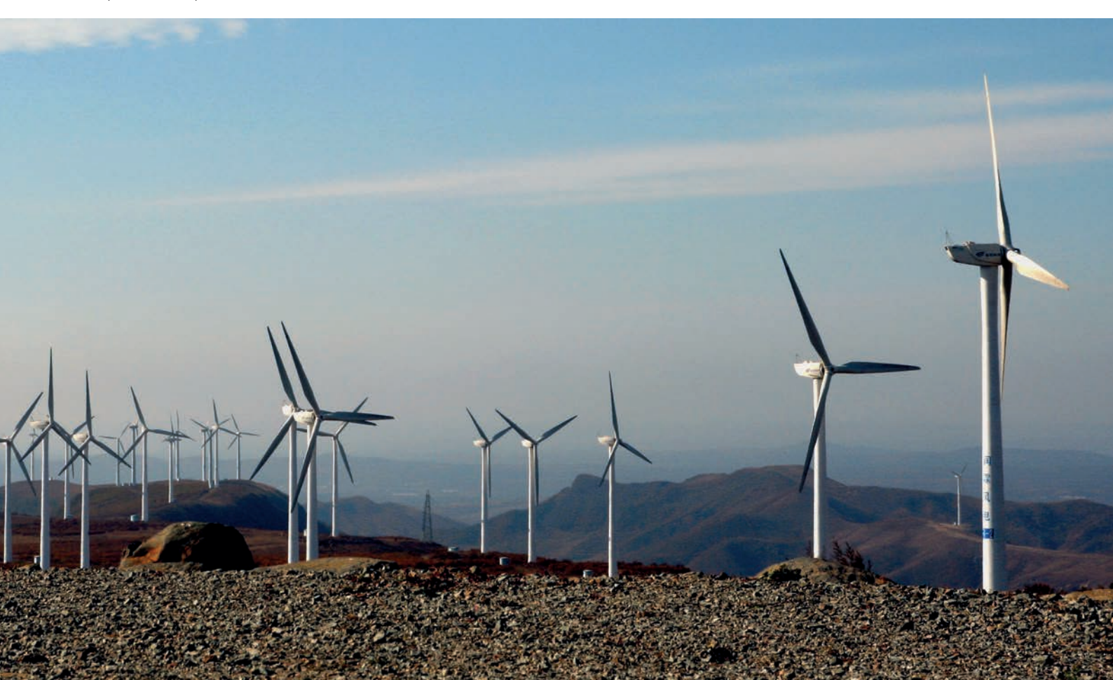
Figure 7: Mulan Wind Farm near Harbin City. China accounts for over a third of global investment in clean energy (REN21 2015).