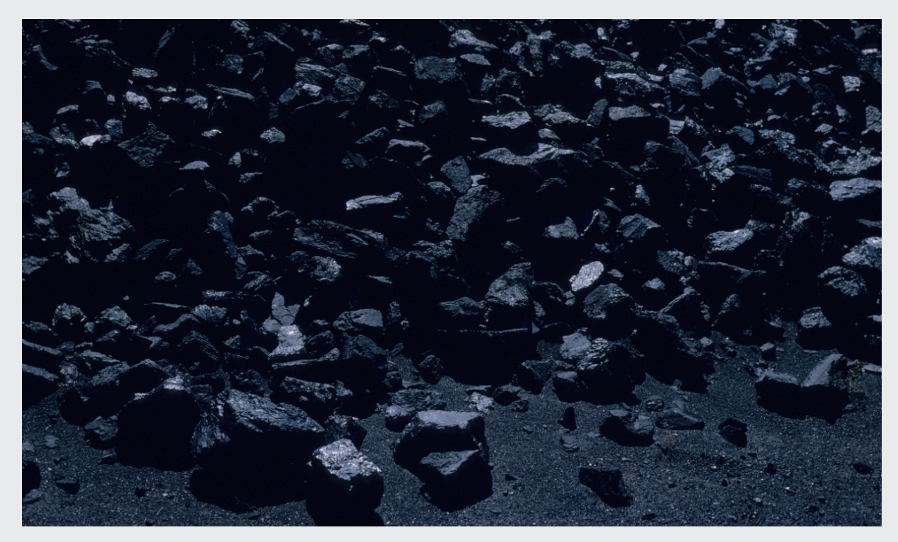
Figure 4: Coal is never "clean"; it pollutes the environment and damages our health.

For very clear and commercial reasons, major Australian energy companies have ruled out building new coal plants. The Australian Energy Council sees them as "uninvestable". Consistent with APRA's February 2017 Climate Risk position, banks and investment funds are not interested (APRA 2017). Any new coal plants would be much more expensive than renewables and carry a huge liability through the carbon emissions they produce (see Section 3).