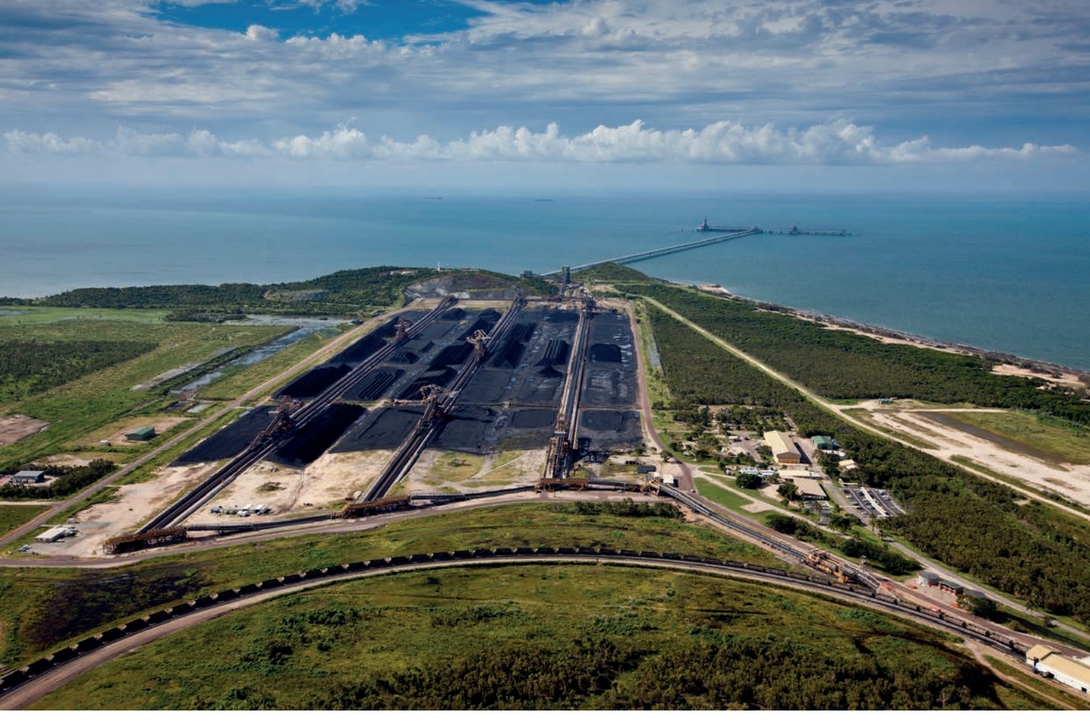
Figure 15: Abbot Point Coal Terminal in Gladstone, surrounded by wetlands and coral reef. This may become one of the world's largest coal ports if the coal terminal expansion goes ahead.

regions in the poorest areas of India. Coal also causes early death and reduces work productivity, therefore contributing to the maintenance of poverty. Death and ill health from air pollution can be substantially lowered with emission reductions of major sources of pollution.