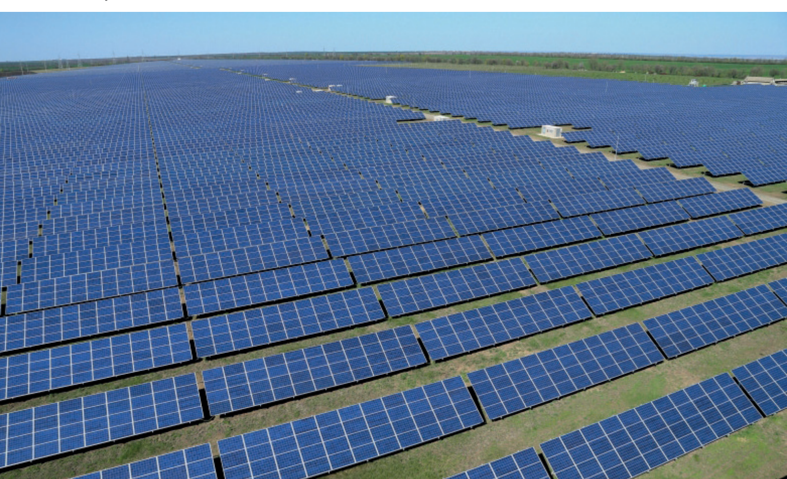
Figure 6: A large-scale solar farm (43MW) in southeastern Europe. More solar PV was added globally in 2016 than in any other year.