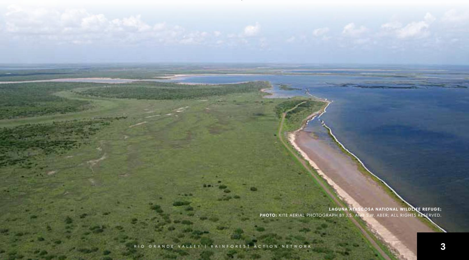
LAGUNA ATASCOSA NATIONAL WILDLIFE REFUGE; PHOTO: KITE AERIAL PHOTOGRAPH BY J.S. AND S.W. ABER; ALL RIGHTS RESERVED.

If built, the three proposed LNG terminals in the Rio Grande Valley could significantly impact the local fishing, shrimping, and eco-tourism industries. Nearby South Padre Island, a well-known destination for its sport fishing, bird-watching, and pristine beaches, could have its beauty and its economy compromised by flaring towers hundreds of feet tall, the release of millions of gallons of effluent water, and the brown haze that would come with the thousands of tons of air pollution. 7 In the Rio Grande Valley, nature tourism alone leads to 6,600 part- and full-time jobs. An LNG terminal, on the other hand, creates mostly temporary construction jobs, and typically only a few hundred permanent jobs. 8 The largest terminal proposed for the Rio Grande Valley would only create about 200 permanent jobs, while its effects would put an unknown number of livelihoods in jeopardy. 9 These economic concerns, along with the threat to the environment and public health, have prompted many city councils and groups to formally oppose the projects, including the City of South Padre Island, the City of Port Isabel, the Town of Laguna Vista, the Laguna Madre Water District, the South Padre Island Business Owners Association, the Texas Shrimp Association, and the National Park Service. 10