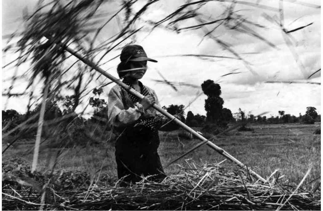
A young girl works in a field in Shan State, south of Hsipaw. The fields had been confiscated after the Shan State Army ended their truce and the Burmese authorities took the land belonging to the SSA and villagers. They then forced the entire village to harvest the rice before taking it to sell in the market in Lashio. 2005.

The intimidation of victims has made genuine inquiries about sexual violence difficult and dangerous. The junta's response violates the right to truth, justice, and a guarantee of non-recurrence that are integral parts of combating impunity. This pattern too often leaves victims without recourse and at times punishes them for the violence they have suffered. A similar pattern of response emerges from the analysis of forced labor and child soldiering in Burma.