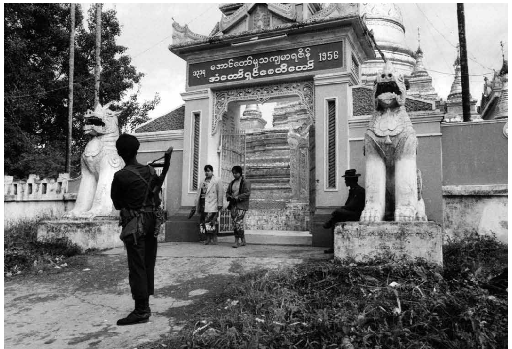
Burmese troops watch as women leave a Buddhist temple near Myitkyina in Kachin State, 1998.

During the course of the SPDC's two decades as a transitional regime, human rights organizations and the United Nations have documented a wide array of human rights violations committed by the ruling junta and its predecessor, the SLORC. This section examines three categories of these allegations, specifically the military's responsibility for acts of sexual violence, forced labor, and the recruitment and use of child soldiers, as well as the general lack of accountability for these violations. This report focuses on these particular categories because the Burmese government has clear international obligations to investigate and address them, having signed the 1979 Convention on the Elimination of All Forms of Discrimination against Women (ratified 1997), the 1930 Forced Labour Convention (ratified 1955), and the 1989 Convention on the Rights of the Child (accession 1991). The following section analyzes patterns in this record of impunity, drawing together common themes. It also highlights some areas where progress is being made, suggesting strategies that could potentially lead to reforms in Burma.