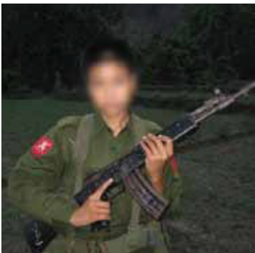
A child soldier, conscripted at 15 years old, who escaped in April 2009 from a Burmese army battalion in Papun District of Karen State.

The Supplementary Understanding was effective for a year. It was renewed for an additional year in February 2008 and again in February 2009. At the end of 2008, the liaison officer reported that since the previous February, the office had received 121 complaints of forced labor, including recruitment of child soldiers, and it had forwarded 70 to the SPDC. 71 Of those 70 cases, the liaison officer considered 50 of the SPDC’s responses satisfactory. In most cases the response was a reprimand, but in some instances authorities paid compensation to victims, established an activity to educate communities or local authorities about the illegality of forced labor, issued new instructions, dismissed the village chairman, or stopped the violations. 72 These outcomes were light on punitive measures and, although they show progress in that they upheld the right to truth and compensation, the absence of justice measures in most cases points to a pattern of ongoing impunity.