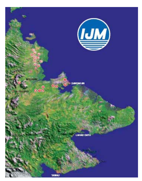
Figure 2. Location of IJM Plantations' oil palm plantations