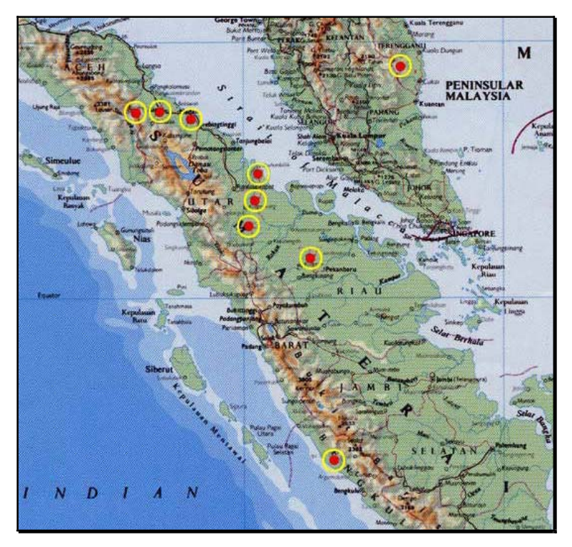
Figure 1. Oil palm estates of the Anglo-Eastern Group