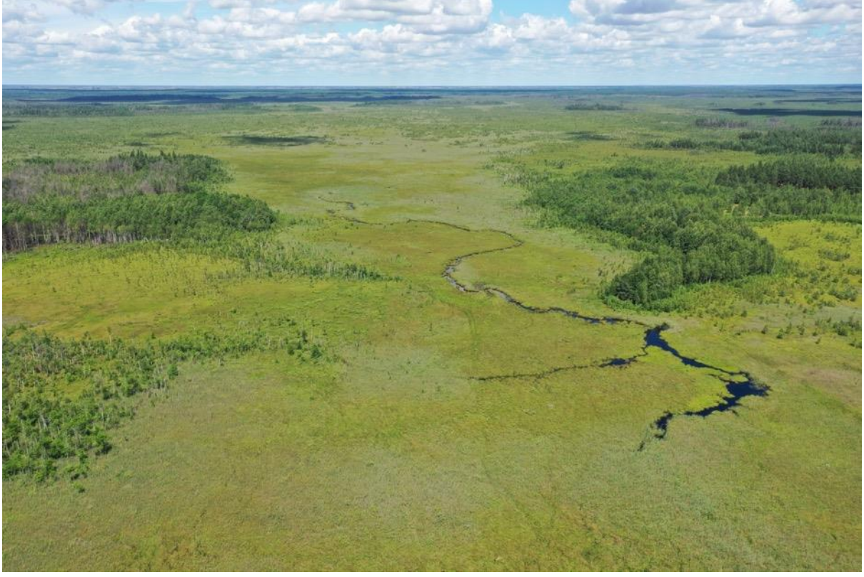
Almany Mires Nature Reserve.

The move followed commitments by authorities in neighbouring Belarus to <u>expand protections</u> of the Almany Mires Nature Reserve in March 2021. Almany was expanded by 10,000 hectares, bringing the size of the reserve up to 104,000 hectares – roughly the size of Hong Kong. Research carried out as part of the Polesia – Wilderness Without Borders project, supported by the <u>Endangered Landscapes Programme</u> and <u>Arcadia – a charitable fund of Lisbet Rausing and Peter Baldwin</u> – helped to identify crucial habitats for rare wildlife in need of protection.