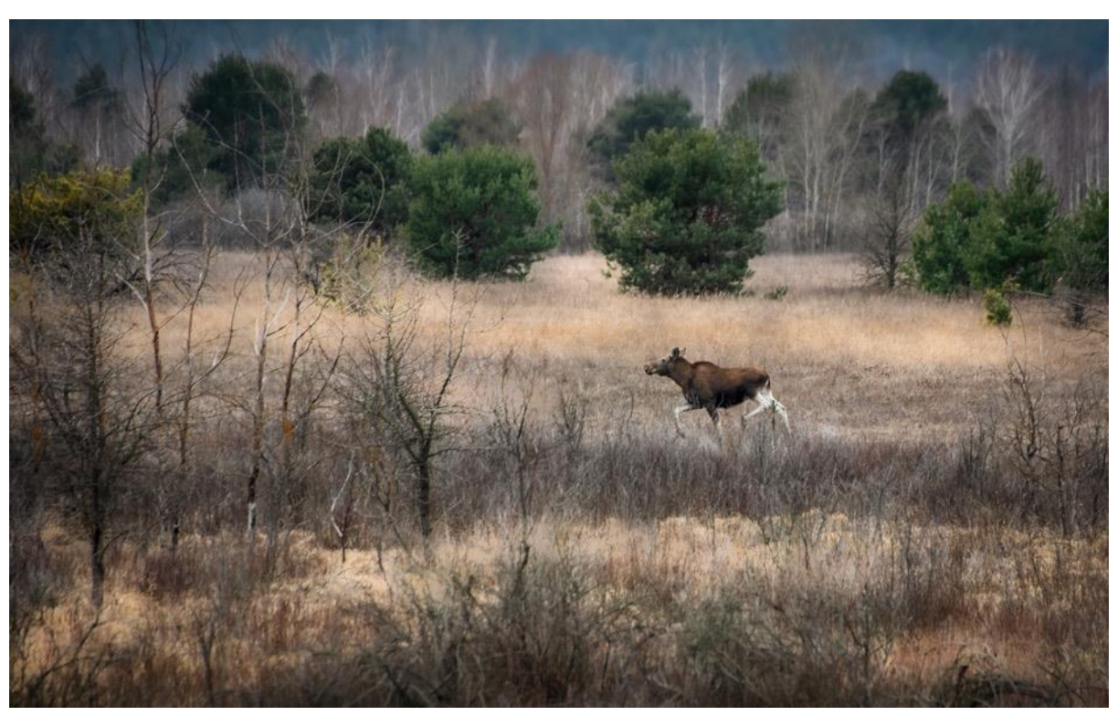
A moose in Polesia.

These vast habitats provide sanctuary to a number of vulnerable species, including eagles, wolves, bears, lynx, and bison. Hundreds of thousands of migratory birds pass through the region. In the springtime, numbers of at least 150,000 – 200,000 Eurasian Widgeons, 200,000 – 400,000 Ruffs, and 20,000 – 25,000 Black-Tailed Godwits have been recorded in Polesia's Pripyat floodplains alone. It is a key breeding ground for many globally threatened species.