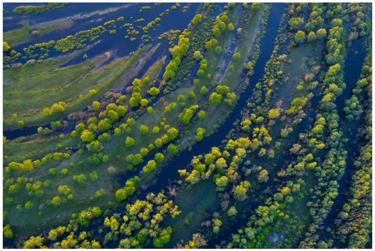
Pripyat River, Polesia.