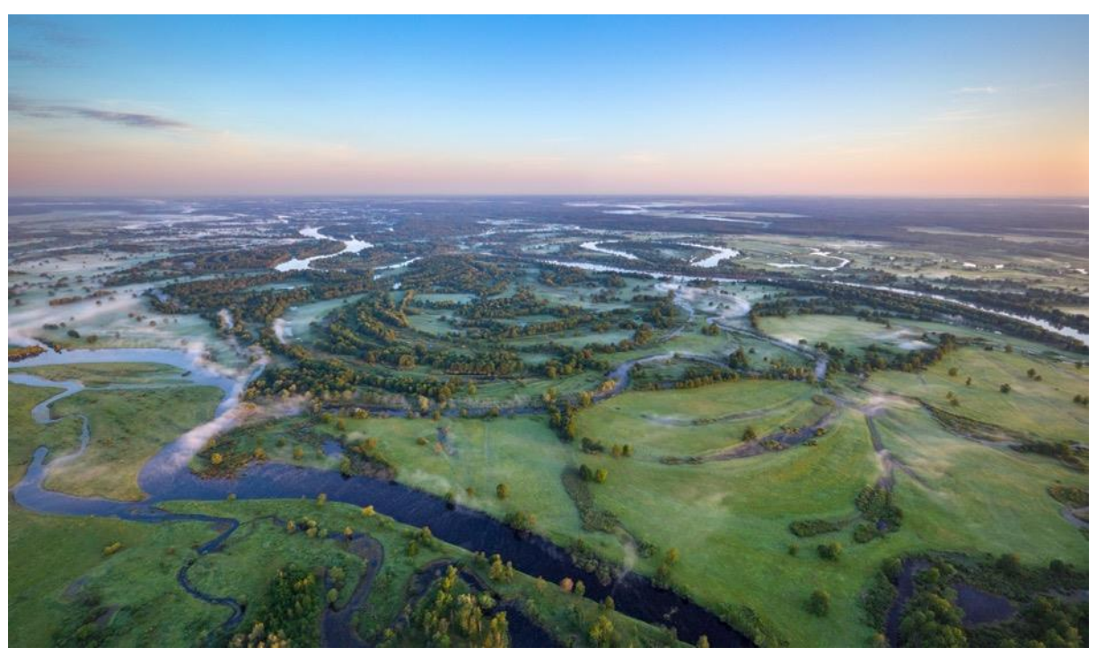
Pripyat River, Polesia.

Following important steps taken in Belarus and Ukraine to protect peatlands at the heart of Polesia, conservationists want to see the region awarded UNESCO status