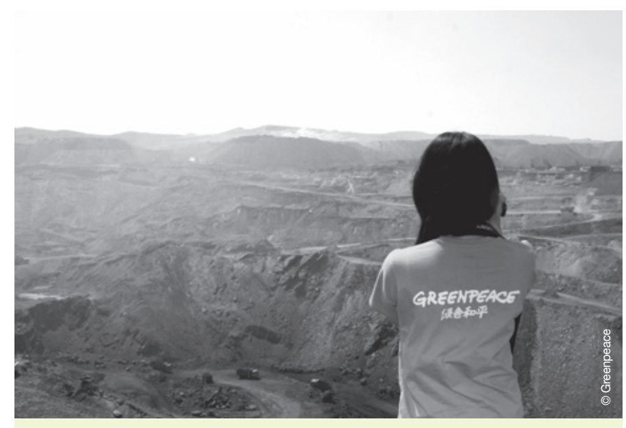
Coal is one of the dirtiest sources of energy used in China, and it is causing the country to become the world's biggest CO2 emitter.

ARE BANKS and financial institutions responding to calls such as these by the world's leaders and economists with proper measures and substantial actions? It might seem so. In December 2008, a group of international banks and insurance companies consisting of Credit Agricole, HSBC, Munich Re, Standard Chartered and Swiss Re published the Climate Principles. According to the press release, these aim to "provide strategic direction across the full range of financial products and services, including research, asset management, retail banking, corporate banking, insurance and re-insurance, investment banking and project finance."