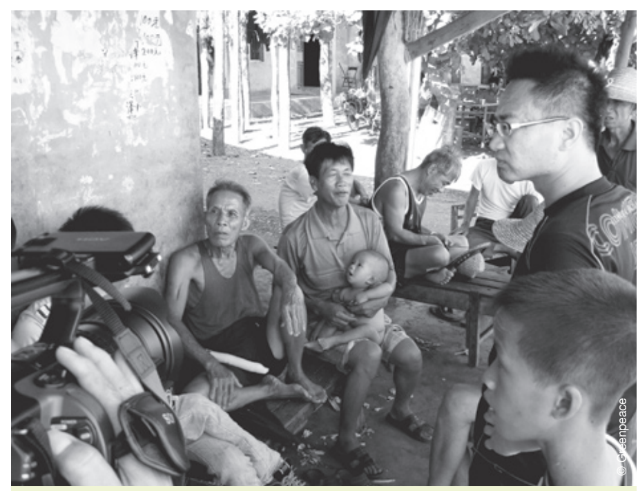
Greenpeace researcher interviewed a local community in Yangpu Gongtang Lower Village in Hainan province. Villagers reported severe pollution of the village's drinking water, polluted inshore waters and a decline in fish yield.

First, let us look at what the Chinese government is doing to weather the economic storm, and why. While investors are seeking opportunities for new gains, governments worldwide are busy implementing bail-outs and stimulus packages. In China, a sharp fall in anticipated export figures has sparked fears about recession among government officials, economists and the general public. Last November, the State Council announced a