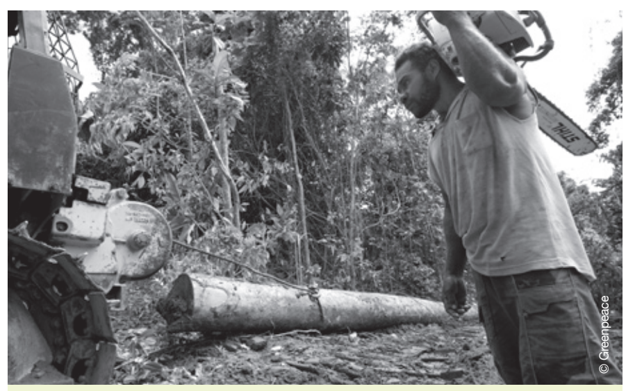
Logging in the Cape Orford logging concession, near Pulpul village, East New Britain Island, Papua New Guinea

In today's global financial crisis, regulators unquestionably need to overhaul their existing regulatory frameworks. Such an overhaul must embrace higher and more transparent disclosure standards. It must also take growing environmental trends into account; and it must help to strengthen the ability of investors to