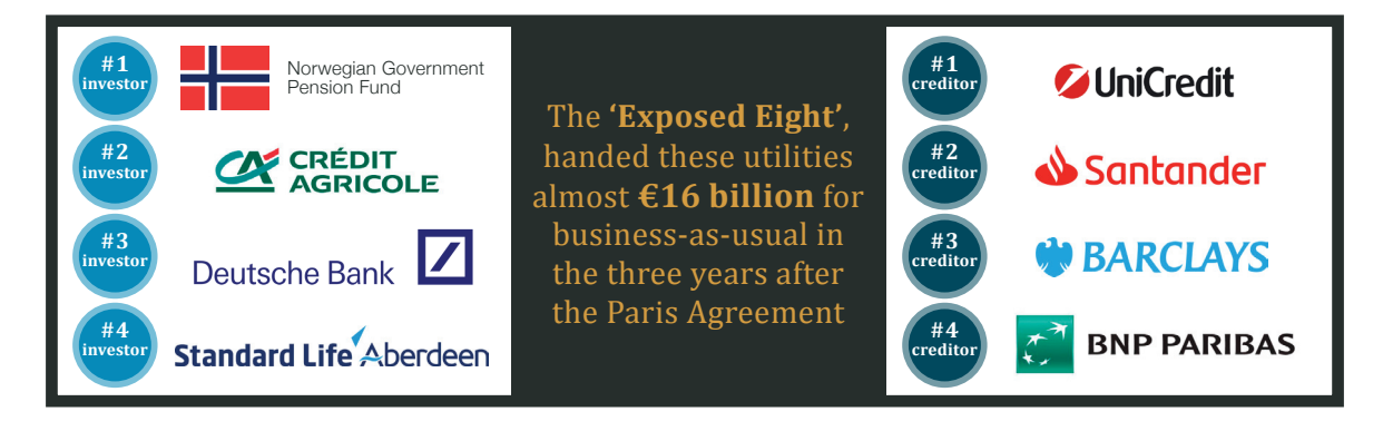
Figure 3: The 'Exposed Eight'

On the creditor side, UniCredit was the largest bank providing €3.13 billion in loans and underwriting services. Santander follows with €2.99 billion, Barclays with €2.71 billion and BNP Paribas with €2.57 billion.