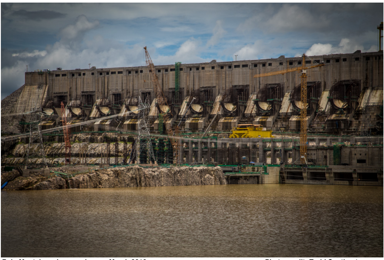
Belo Monte's main powerhouse, March 2016