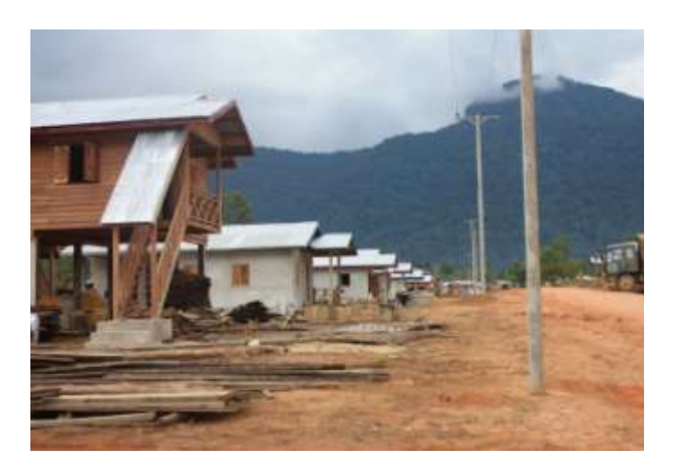
Figure 8: Resettlement site in Nongxong Village

In the CA and RAP, THPC promised to provide displaced persons 440 kg of milled rice per person per year and an additional support of supplementary protein to meet basic nutritional shortfalls during the transition period until livelihood activities provide subsistence requirements. However, the village headman in Phabang Village