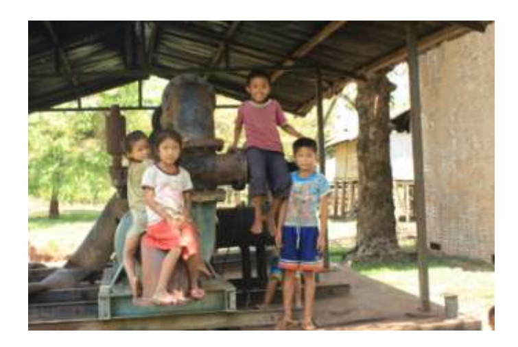
Figure 2: Children playing with an abandoned irrigation pump in Kongphat Village

Fluctuating water levels and stronger flows have caused erosion along the Hai and Hinboun rivers leading to the loss of fertile agricultural land, fruit trees, riverbank gardens and vegetation. Resource Management and