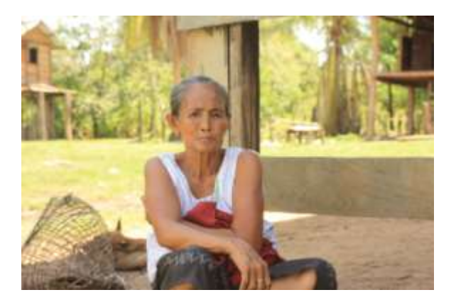
Figure 10: Woman in Kongphat Village concerning about compensations for the displacement.

THPC's Logical Framework adopted in 2001 to address mitigation and compensation needs included a commitment to conduct independent evaluations and review of the program every two years. The company did conduct an independent