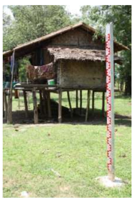
Figure 5: A water gauge set up in Xang Village

Regarding the cost for resettlement entitlements and relocation of affected people, the Decree requires that "Project owners shall prepare the Resettlement Plan with detailed cost estimates for compensation and other resettlement entitlements and relocation of APs" (Article 14, paragraph 1). However, the final Resettlement Action Plan does not include costs for resettlement in the downstream areas. It only includes a budget for infrastructure development and livelihood improvement (THPC 2008, Part3: 71-72).