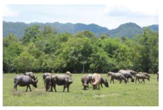
Figure 7: Cows and water buffalos in Kongphat Village

The village headman in Sopkhom Village has 1.5 ha of rice paddy (enough to feed eleven family members), 0.6 ha of riverbank gardens where he grows chili, and eleven cows grazing in the village. In his riverbank garden, he harvests 1.2 tons of chilies a year, which he can sell for 10,000 kip per kilogram to the market in Lak Sao. He is going to lose all his land due to the project; however, he is having difficulties finding replacement land near the resettlement site where he is supposed to move sometime between 2009 and 2011.