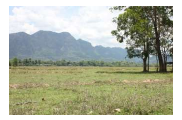
Figure 9: Abandoned paddy fields in Xang village

By their own admission, THPC has had difficulties ensuring the profitability of the dry season rice program due to the high costs of pumping water and of inputs such as fertilizer (THPC 2008, Part 3: 47).<sup>13</sup> Villagers have reported declining yields over the five years since the program was introduced, and a corresponding increase in debt to the village savings and credit funds (FIVAS 2007: 47). The Theun-Hinboun Expansion Project resettlement plan admits that only 872 families were still involved in the program as of 2007, out of approximately 5,000 families living in the downstream areas (THPC 2008, Part 3: 47).