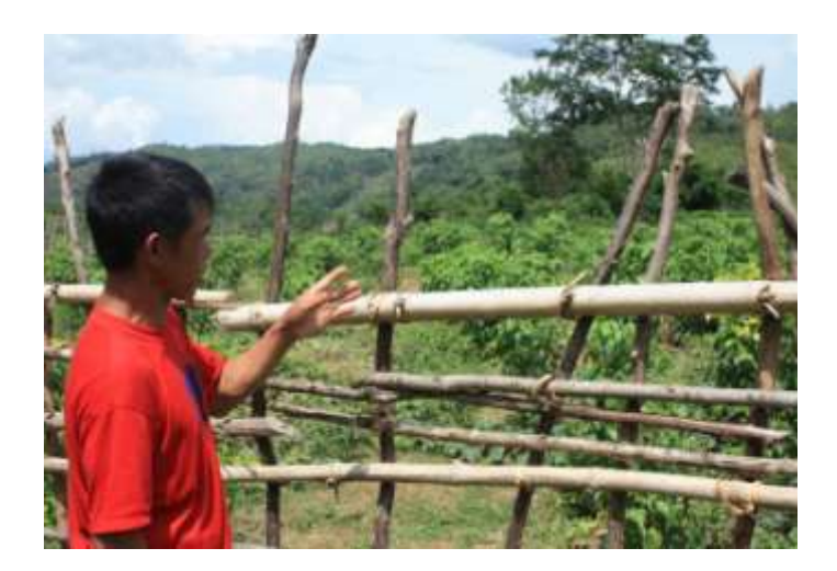
Figure 6: The villager in Sopkhom Village concerning about the compensation for his riverbank garden growing chilies and tobacco

However, villagers in Somboun Village who have lost their entire land holding reported that each family is entitled to only one hectare of farmland in the resettlement area and cash compensation for the remaining lost land. One of our interviewees in Somboun used to have 2-3 ha of land, including 1.8 ha of rice paddy and a vegetable garden. They used to collect bamboo shoots and wild boar from the forest and fish from the river. The village headman in Somboun Village used to have three hectares of rice paddy. His wife reported that "we received only a little bit of money to compensate for our land and the money is not enough to buy new land."<sup>5</sup>