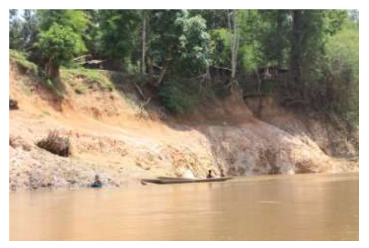
Figure 3: Erosion along the Hinboun River

Research (RMR) - a consulting firm originally contracted to conduct the EIA for the proposed expansion project – estimated that as of 2005, the original Theun-Hinboun project had caused the Hai River channel to widen by about 45m, leading to the loss of around 68ha of land (RMR 2006: 2-24). RMR estimated the value of this land to be between $100,000 and $136,000, but villagers have not received any compensation for these land losses. These impacts have become more and more severe since the project started operating in 1998. During the field visit, the village