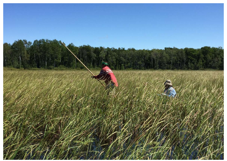
Wild Rice Harvest, Flowage Lake, August 2015

Enbridge's Line 3 has already faced 2 years of fierce resistance in the Great Lakes, led by Ojibwe tribes and grassroots groups like Honor the Earth, MN350, and Friends of the Headwaters. For 4 years, we fought the proposed Sandpiper pipeline, which would have established the new Line 3 corridor. Eventually, Minnesota combined the Sandpiper and Line 3 applications into one regulatory process, and a successful 2015 Friends of the Headwaters lawsuit forced them to conduct a full, cumulative Environmental Impact Statement (EIS) on both lines. In August 2016, we defeated the Sandpiper, but the battle against Line 3 remains. Minnesota is currently writing its EIS for Line 3, after months of battle over what the study would include and who would perform the analyses. The draft EIS is scheduled for April 2017 and the public will have a chance to comment at a series of public hearings. A final permit decision is expected in Spring 2018.