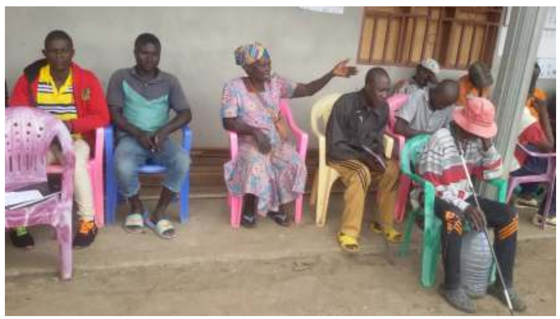
Photo: Participatory approach integrating gender (women, youths, handicaps (blind), men...)