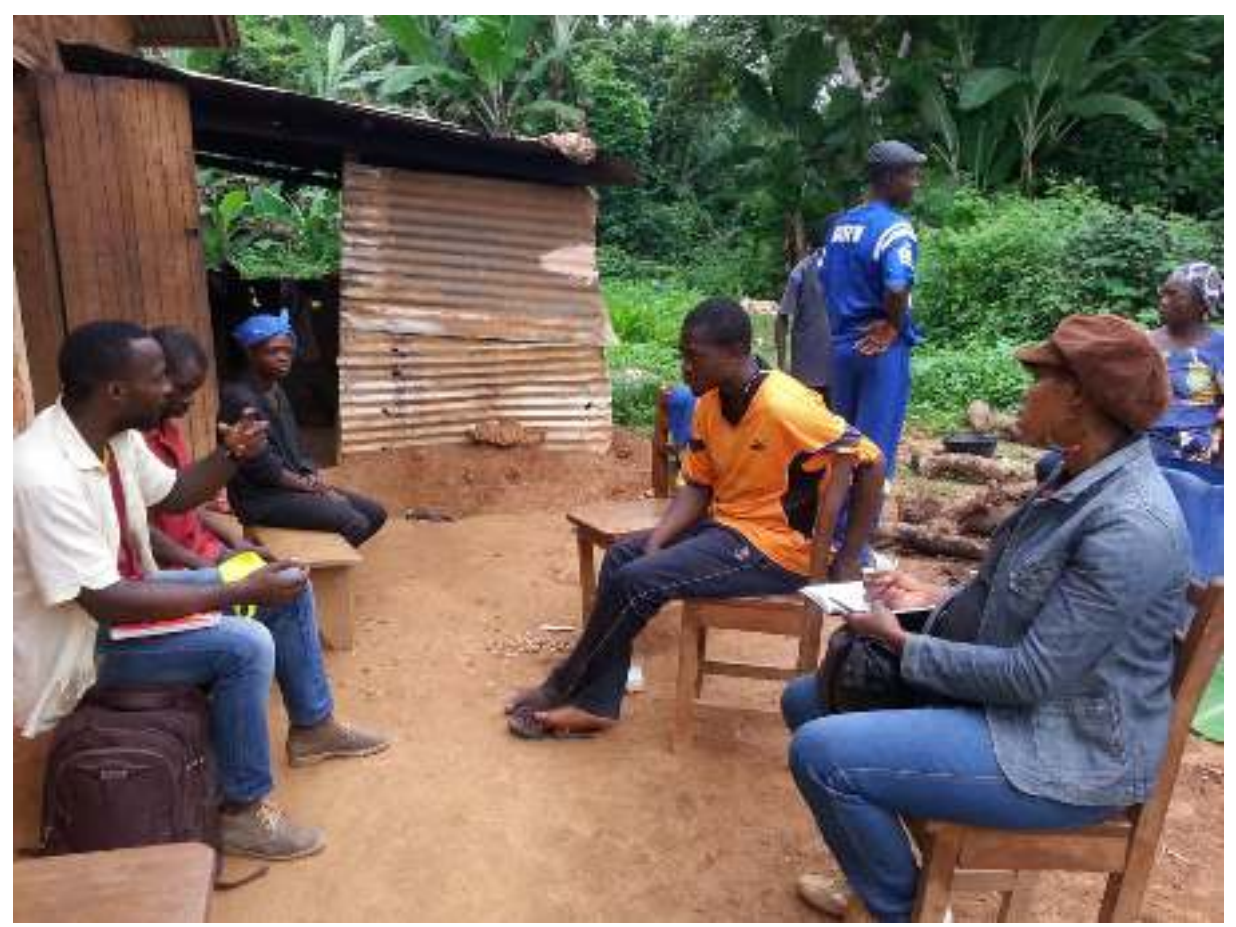
Photo: Meeting with the chief and some notables of the Binadjengue village where the sacred site is located.

available to them was the sum of 3,000,000 FCFA for the ceremony of moving the site to another location. The latter believe that this represents absolutely nothing at all as they lost the water that served as a medicine, the pharmacopoeia, and the fish that were useful for their traditional rites.