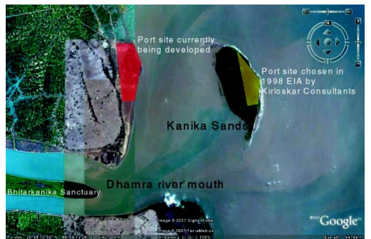
Fig.1: Map showing discrepancy between port site chosen by the EIA and the one currently being developed.