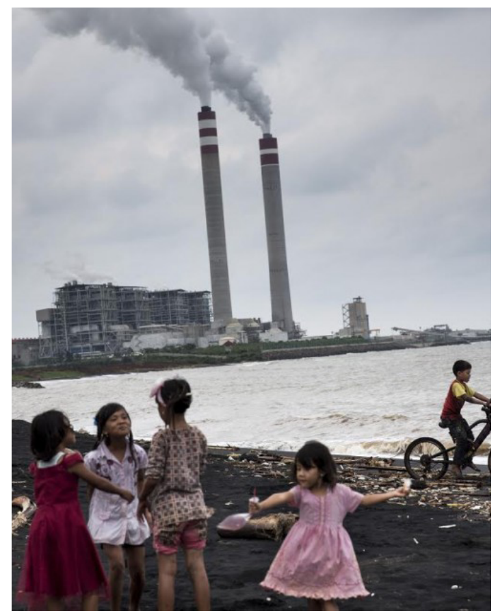
To its credit, Crédit Agricole declined this year to finance the TJB2 coal plant in Indonesia, but it is still financing coal power developers in Southeast Asia

It is therefore urgent for this French bank, which remains heavily involved in the coal sector, to reinforce its exclusion criteria, and to stop financing all companies planning new coal expansion. It must also stop financing companies deriving more than 30% of their revenues from coal mining, or 30% of their power production from coal, as well as companies producing or burning more than 20 million tons of coal a year.