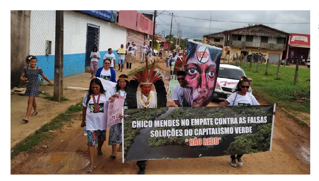
Demonstration against green capitalism in Xapuri.

including those from its supply chain (known as Scope 3).<sup>13</sup> In December 2020, Nestlé launched its "Net Zero Roadmap", committing to reduce its emissions by 50% by 2030 and to "net zero" by 2050. The majority of these emissions occur in its supply chain, especially in the sourcing of dairy, meat and commodity crops (coffee, palm oil, sugar, soybeans, etc).<sup>14</sup> Nestlé's annual Scope 3 emissions are roughly double the total emissions of its home country, Switzerland.<sup>15</sup>