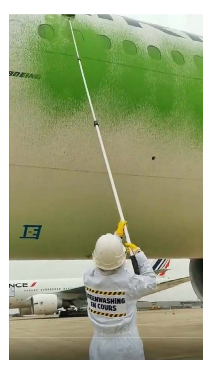
Greenpeace greenwashing action against Air France, 5 March 2021.

The problem we are confronted with is not how to get the BlackRocks or Nestlés of this world to invest in solutions to the climate crisis. It is how to take back control over the funds, resources and governments that are currently captured by corporations in order to support genuine solutions to the climate crisis that serve the needs of people.