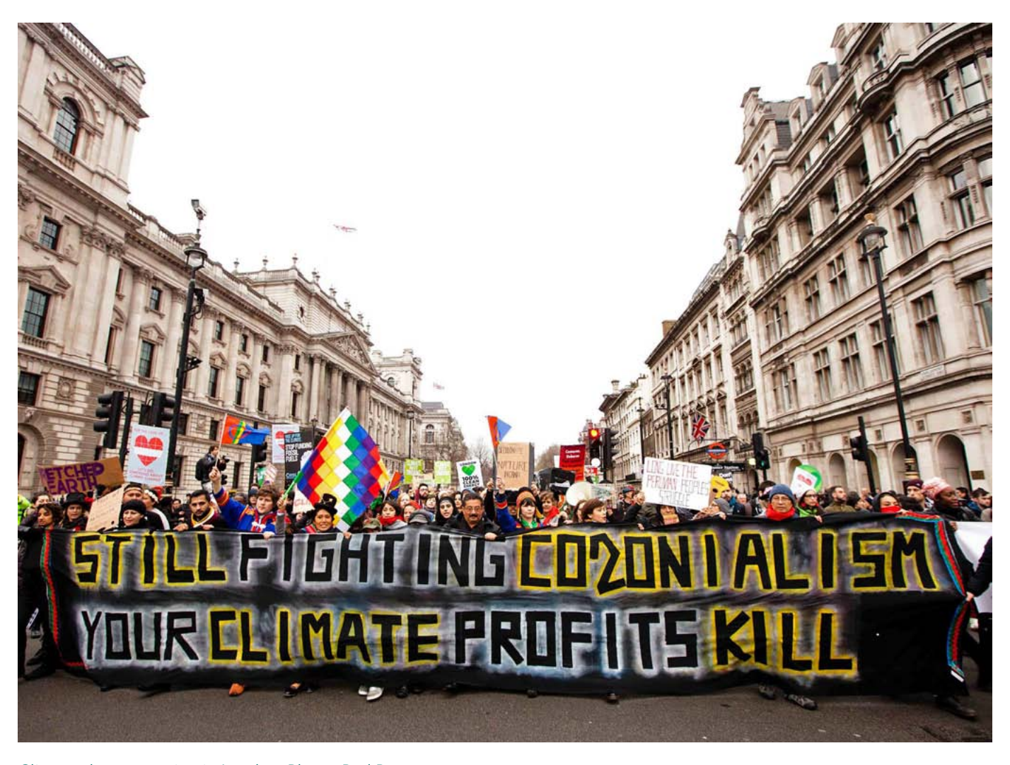
Climate demonstration in London.

are in danger of being cut down or by planting trees on degraded lands. Corporations are now collectively referring to these offsets as "nature-based solutions".<sup>21</sup>