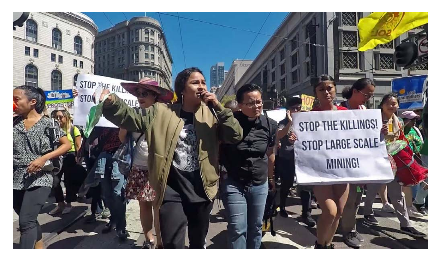
Climate demonstration in San Francisco, USA, 2019. Photo: Climate Justice Alliance Vimeo video "Defend the Sacred, End Climate Capitalism, and Support Community Solutions from the Frontlines"

All of this for what? There is no way to truly get to a point of net zero emissions, where the amount of GHG being emitted into the atmosphere is no more than the amount being drawn out of the atmosphere, if the emissions from the burning of fossil fuels and other major sources of GHGs are not reduced to near zero. For all of the damage that the coming offset land grabs will inflict on communities in the global South, nothing will be done to stop global warming. As stated in a newly released report by La Via Campesina and a coalition of other NGOs and social movements, the corporate net zero plans and pledges that are coming fast and furiously these days make it crystal clear that "there is no desire or ambition on the part of the largest and richest in the world to actually reduce emissions. 'Greenwashing' hardly suffices as a term to describe these efforts to obscure continued growth in fossil emissions - 'ecocide' and 'genocide' more accurately capture the impacts the world will face."40