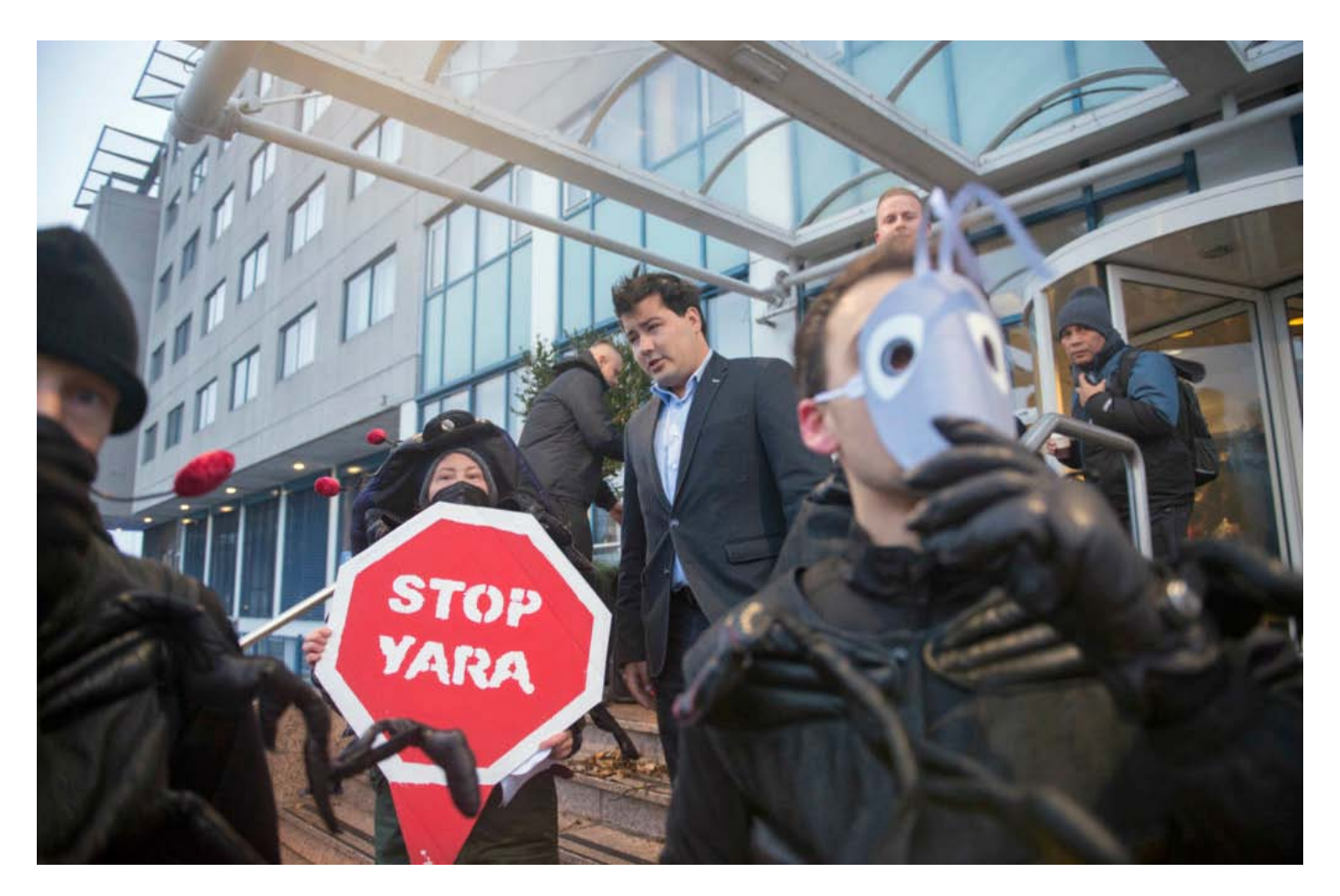
Activists from the Fossil Free Agriculture campaign protest in front of the European Mineral Fertilizer Summit.

"Net zero" and "nature-based solutions" are a deadly fraud