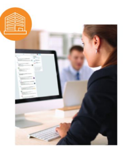
PROTECT NATIXIS AND GROUPE BPCE ASSETS AND REPUTATION