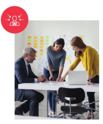
BE CLIENT CENTRIC