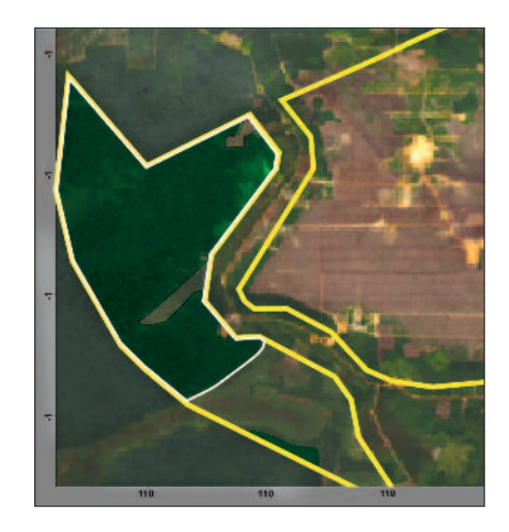
Figure 1. Deforestation of High Conservation Value Area (LSM plantation)

LSM: Bumitama shares map with stakeholders showing a large HCV area in the west of the concession area.<sup>11</sup>