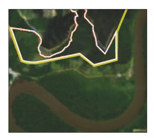
Figure 2. Land clearing after October 2013 (LSM plantation)