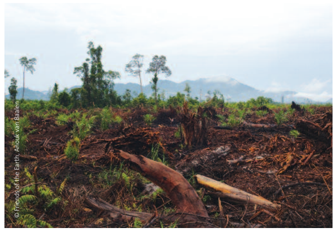
Peatland development by Bumitama in LSM concession.