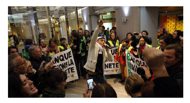
During COP21 protestors flash mob a branch of BNP Paribas in central Paris to demand the bank end its multi-billion dollar financing for fossil fuels.

Among them, will certain BNP Paribas clients be compelled to end their coal activities quickly by a certain date, for example 2020? And for how much longer will the bank continue to support major companies which nonetheless count on coal as part of their diversified portfolios?