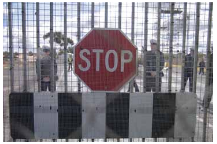
Police securing the gates of Olympic Dam mine South Australia, July 2012.

The risks would escalate if plans for a massive expansion of the mine are revived. The BHP whistleblower said. "Assertions of safety of workers made by BHP are not credible because they rely on assumptions rather than, for example, blood sampling and, crucially, an assumption that all workers wear a respirator when exposed to highly radioactive polonium dust in the smelter."