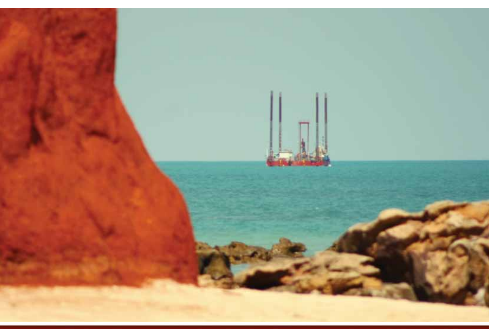
Alternative Annual Report 2012