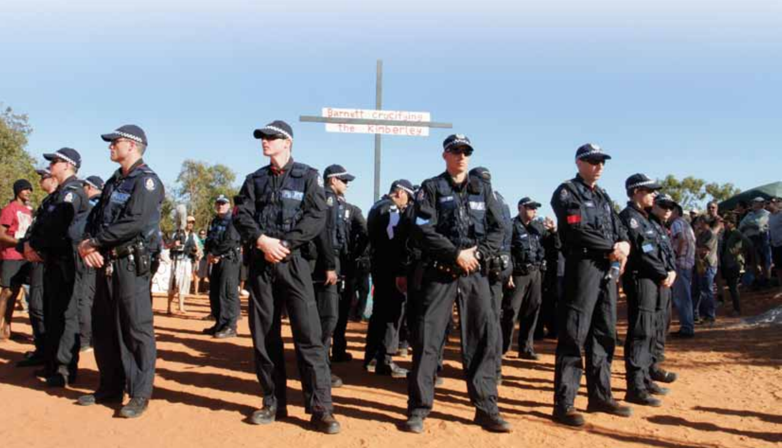
WA Police defend Woodside machinery from protesters.

Go to our website – www.wilderness.org.au/kimberley - and have a read. There are actions you can undertake that are identified on the website. And feel free to give us a call or email. The details are on our website. We are keen to work with the people of Australia to help the people of Broome and to ensure this global treasure maintains its environmental and cultural values.