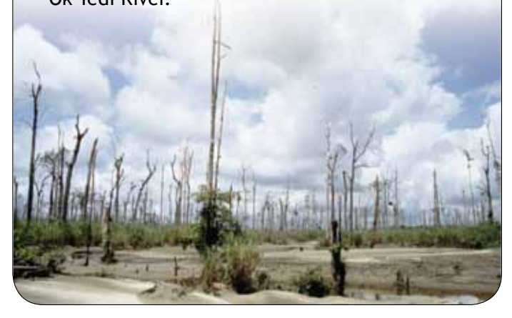
The Ok Tedi River in 1998. Each year 100 million tonnes of waste from the Ok Tedi mine are released into the Ok Tedi River.

One can only hope shareholders would never support the company returning to PNG after the damage it has caused to the rivers, the environment and the people