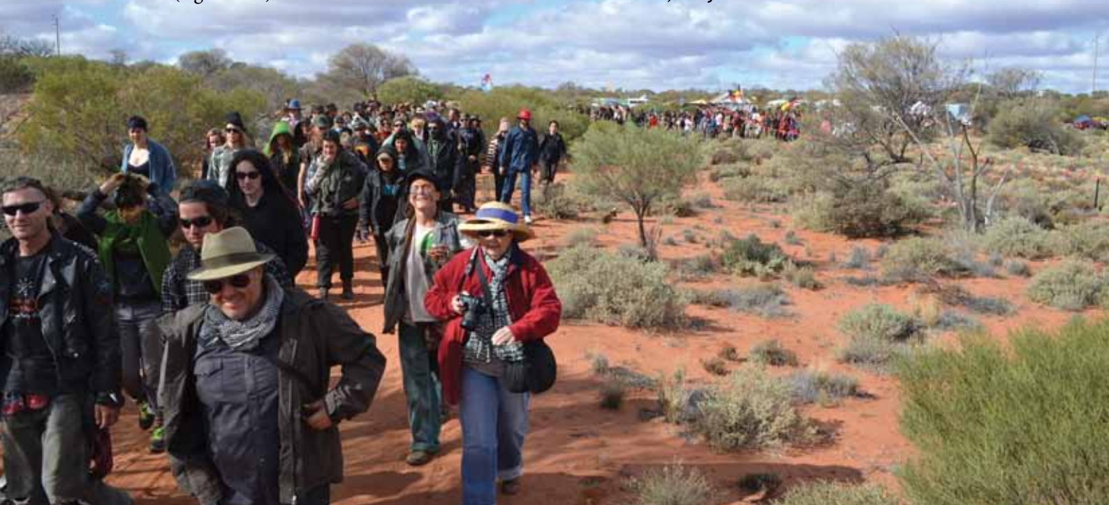
Protesters begin to march from their arid camp to the gates of Olympic Dam mine, July 2012

lizardsrevenge.net foe.org.au/anti-nuclear australianmap.net