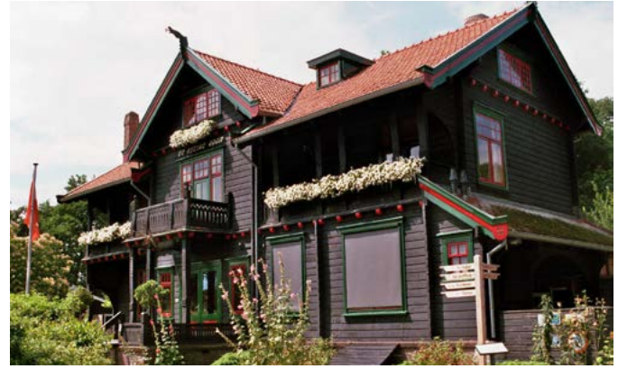
BankTrack's campaigners gathering took place in Gorssel, The Netherlands in October

The Gathering also saw the official launch of BankTrack's new website. The new site gives a fresh presentation to our profiles of over a hundred banks and the Dodgy Deals they are financing, as well as news, blogs and campaign resources. The new design focuses on making the site easier to use, sleeker and faster to navigate. The redesign follows BankTrack's reorganisation at the start of 2015, from a network of civil society groups to an independent campaigning organisation.