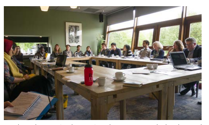
BankTrack-organised meeting between Dutch banks and forest NGOs, Utrecht, October 2016

At BankTrack's campaigners' gathering in October (see page 18), BankTrack and EPN organised several forest-finance related sessions aimed at facilitating coordination among the many NGOs globally working on forests and finance.