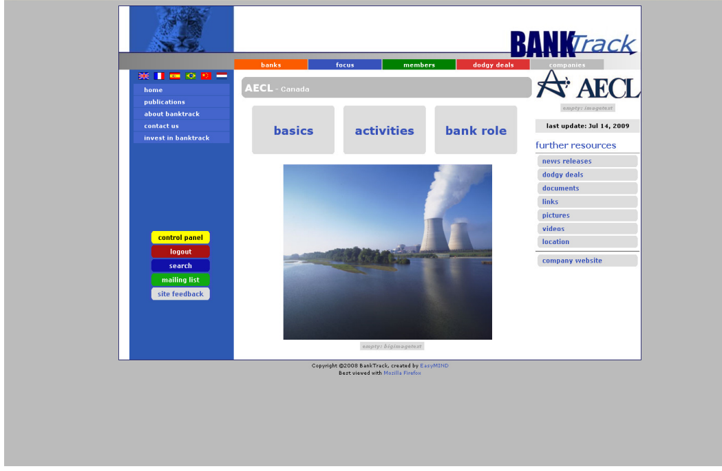
dodgy deal and company profile