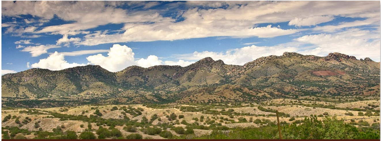
The mile-wide open pit mine would be immediately below the ridgeline near the center of this photo. Virtually everything below the ridge would be buried under tailings and waste.

The Rosemont mine, therefore, would pump water that further depletes an aquifer in the Santa Cruz River valley on west side of the Santa Rita Mountains, while simultaneously destroying a watershed on the east side of Santa Rita Mountains. At the end of mining, the Company would also leave behind a massive pit lake.<sup>42</sup>