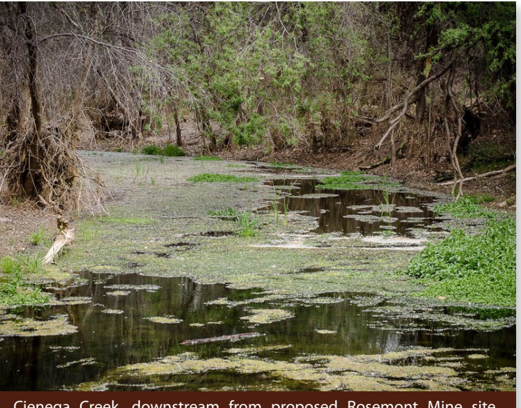
Cienega Creek, downstream from proposed Rosemont Mine site. (3/14/12)

become toxic sink holes with acidic water. Arizona has a long history of ground water contamination that is a direct result of copper mining, including a sulfide ground water plume a few miles west of the Rosemont site resulting from years of copper mining on the desert floor.