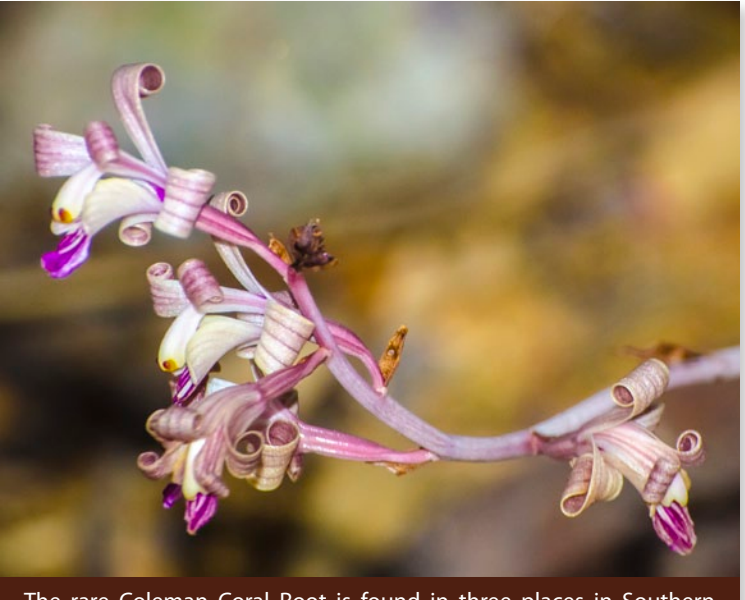
The rare Coleman Coral Root is found in three places in Southern Arizona including two sites in the Santa Rita Mountains, one of which would be destroyed by the proposed Rosemont Mine.

The Santa Rita Mountains provide important recreation opportunities and contribute directly to southern Arizona's $2.5 billion a year tourism economy. The Arizona Game & Fish Department states the mine would render the northern half of the Santa Rita mountains "virtually worthless" for wildlife habitat and recreation.<sup>45</sup> An open-pit mine high in the Santa Rita Mountains would have a negative impact on Saguaro