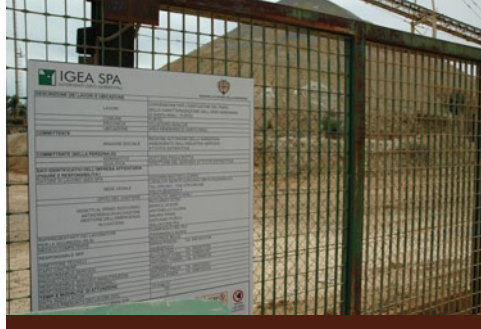
Abandoned Sargold mine site in Sardinia, Italy