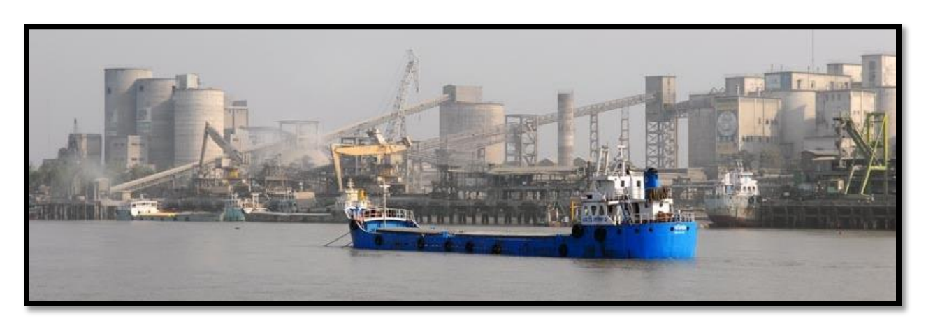
Industrial development and shipping are increasing along the Pashur River, including at Mongla port, pictured here.<sup>52</sup> The Rampal and Orion power plants will exacerbate these stresses on the Sundarbans ecosystem and its endangered wildlife.

The World Heritage Committee's Statement of OUV recognizes many of these threats, noting that: "Over exploitation of both timber resources and fauna, illegal h[u]nting and trapping, and agricultural encroachment also pose serious threats to the values of the property and its overall integrity." The 2015 State of Conservation report of the World Heritage Committee also notes that "non-renewable energy facilities, salinity, and dredging of the Pashur River are a threat to the property. 51