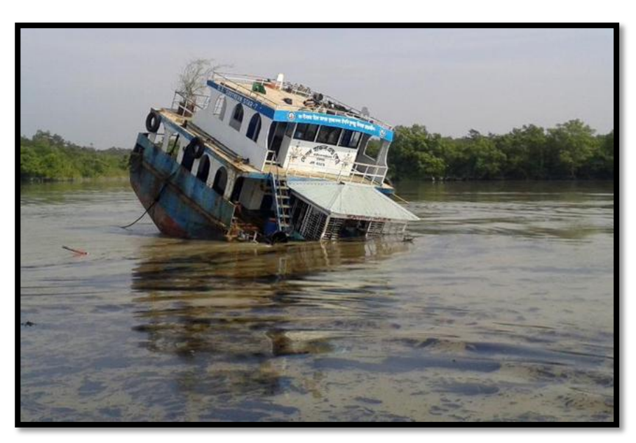
Since 2011, large commercial ships have been allowed into Sundarbans delta. There have been numerous accidents, including the sinking of this oil tanker in 2014, which spilled 350,000 liters of furnace oil.<sup>23</sup>

In all three accidents, the government significantly delayed taking the necessary steps to protect these precious waterways from pollution. For example, newspapers reported that three days after the October 2015 accident there was still no sign of salvaging the wreck, or otherwise containing the toxic material.<sup>24</sup> As we explain in section II below, the inevitable increase in shipping accidents that will take place once the Rampal and Orion plants become operational, coupled with the government's inability to adequately respond to the accidents, poses a serious threat to the property.