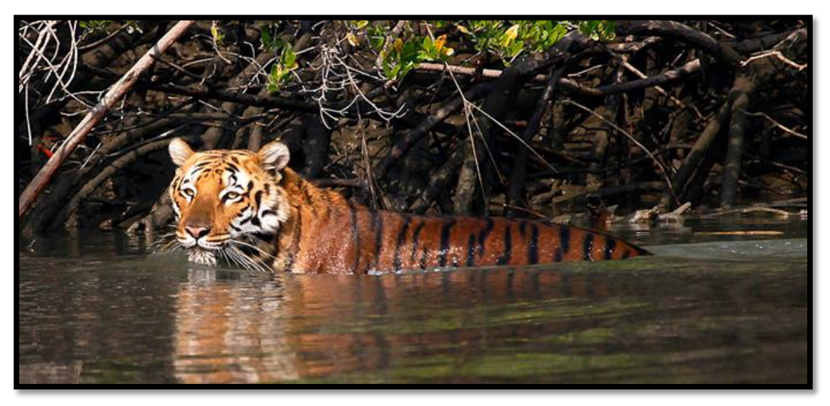
The Sundarbans is one the last viable habitats for tigers, whose global population has fallen by half since 1998 and whose global range has declined over 40 percent since 2006.<sup>42</sup> The proposed power plants are likely to contaminate the food chain of the Sundarbans, harming tigers and jeopardizing their survival.

The Sundarbans are home to many iconic and endangered species including Bengal tiger, Ganges river dolphin, Irrawaddy dolphin, finless porpoise, small clawed otter, smooth coated otter, estuarine crocodile, masked finfoot, fishing cat, Pallas' fishing eagle, river terrapin, white-rumped vulture, and lesser adjutant. The Statement of OUV recognizes many potential threats to these and other species leaving in the Sundarbans, including from natural sources, such as cyclones, and human sources, such as illegal poaching. In the Sundarbans, including from natural sources, such as cyclones, and human sources, such as illegal poaching.