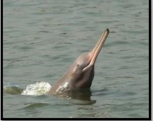
Irrawaddy dolphins (one pictured dead found after the 2014 oil spill) and Ganges river dolphins of the Sundarbans could be harmed by pollution from the power plants, and by increased dredging and shipping on the Pashur River.<sup>86</sup>

Trace amounts of mercury can contaminate large bodies of water and remain in the soil for decades. <sup>87</sup> For example, the equivalent of one gram of mercury deposited from the atmosphere into a 20-acre lake each year can make the fish unsafe to eat. <sup>88</sup> Once in the ecosystem, mercury naturally converts to methylmercury, a highly toxic compound that builds up in organisms and increases in concentration with each level of the food chain; birds and mammals that eat contaminated fish and shellfish, like the Bengal tiger, Ganges and Irrawaddy dolphins, estuarine crocodiles, river terrapin, masked finfoot, and small clawed otters could have potentially high exposures to methylmercury. <sup>89</sup> Methylmercury has been found to bioaccumulate faster in water bodies like the Sundarbans with fluctuating water levels that