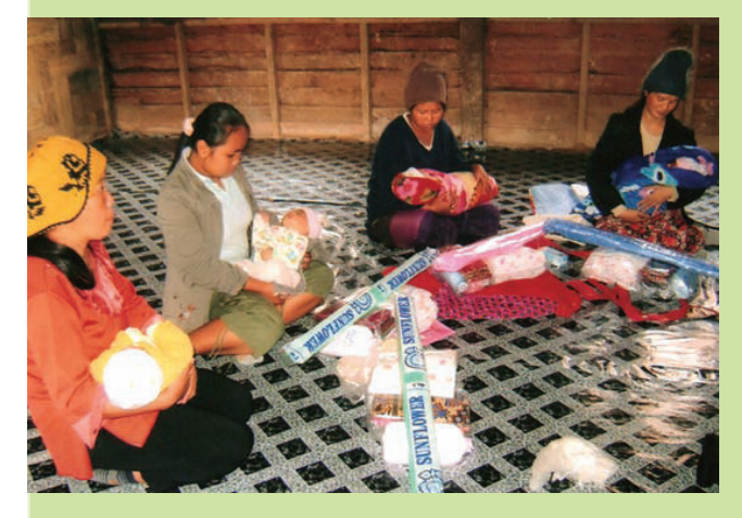
Baby kits given to Shan IDPs