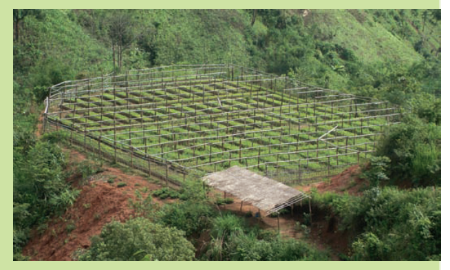
Coffee nursery for IDPs on the Thai-Shan border