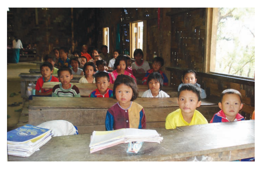
Students at an IDP school on the Shan-Thai border

To address this problem, teachers' committees from the five IDP camps came together early in 2009 and drew up plans to develop a standard school