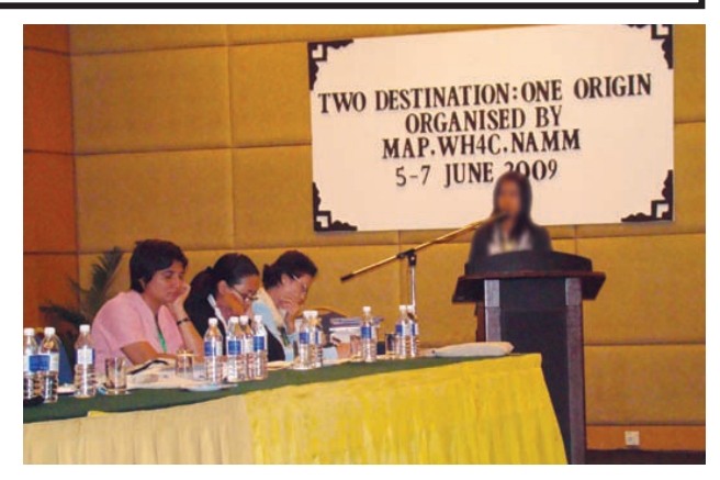
SWAN at a conference on impacts of the economic crisis on Burmese migrants organized by the MAP Foundation, Worker Hub for Change, and Network of Action for Migrants in Malaysia in June 2009 in Kuala Lumpur. 7