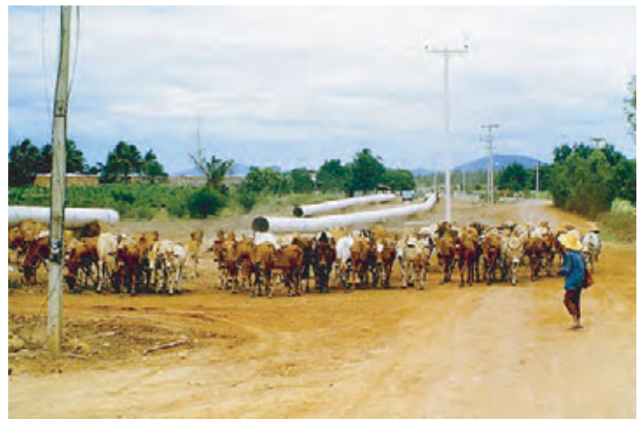
The Yadana pipeline in Burma; thousands were expelled from their lands to pave the way

The Burmese exile Aung Ko described the majority of the Burmese population as "political prisoners" in a 2001 publication of the Berne Declaration, because "they do not have freedom of the press, expression, opinion or religion, nor do they have freedom of assembly or association."(13) Last year the U.N. Human Rights Commission complained about widespread and systematic human rights violations. Particularly affected are members of over 60 ethnic minorities. International Labor Organization (ILO) describes the forced labor commonly found in Burma as a "crime against humanity."(14)