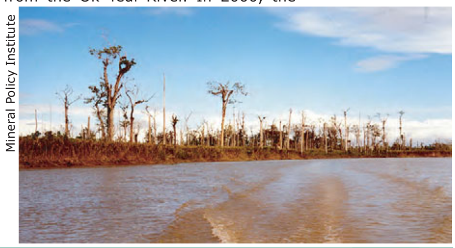
Ok tedi river ... rainforest destruction by

During the 1990s, the scale of the disaster caused by the Ok Tedi mine became increasingly conspicuous and was publicized worldwide by nongovernmental organizations (NGOs). The affected peoples turned to the International Water Tribunal in The Hague, which had no legal authority, but the action increased the moral pressure. BHP agreed to compensation payments and promised to improve riverine dumping of waste disposal; for example in some sedimentation and locations the sediment was dredged tailings from the Ok Tedi River. In 2000, the