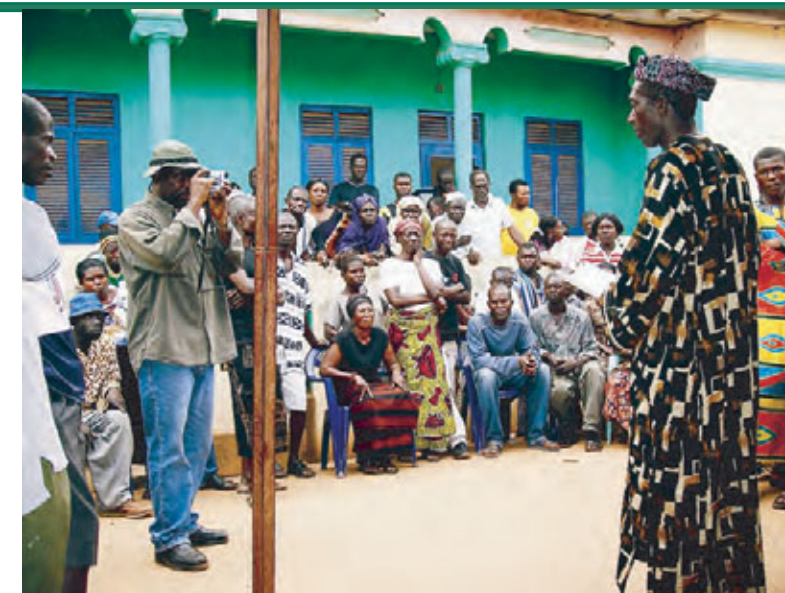
houses can be built quickly but will there be livelihoods as well?