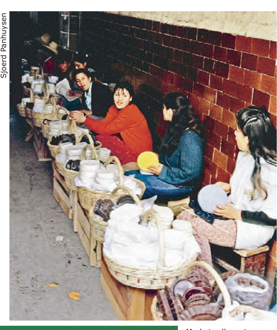
Market sellers at Yanacoha mine, Peru

Both CS and UBS are linked to human rights violations and large greenhouse gas producers via their financing of client projects. The banks need standards for human rights and the climate. The human rights standard should be based on the U.N. human rights norms for corporations. A climate standard should address the measurement and reduction of indirect emissions, and help guide financing away from fossil fuels and towards