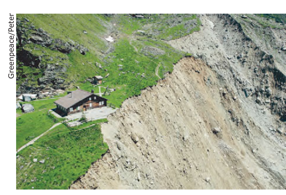
Landslide in Switzerland as a result of excessive rainfall

Up to now, no linkage has been made between the costs that climate change is possibly causing today and the profits from the business of fossil fuels. This could however change in the future. Increasingly, climate protection is being called for through legal channels. Eight U.S. states and New York City did just that, filing claims in July 2004 against five U.S. companies with the highest greenhouse gas emissions. The Inuit, who are directly affected by climate change, filed a petition with the Inter-American Commission on Human Rights, against the U.S. government. In August 2005, a U.S. court allowed a