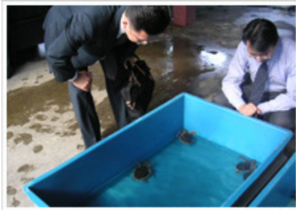
Observing a sea turtle rehabilitation center run by the local fisheries department (Southeastern Asia).