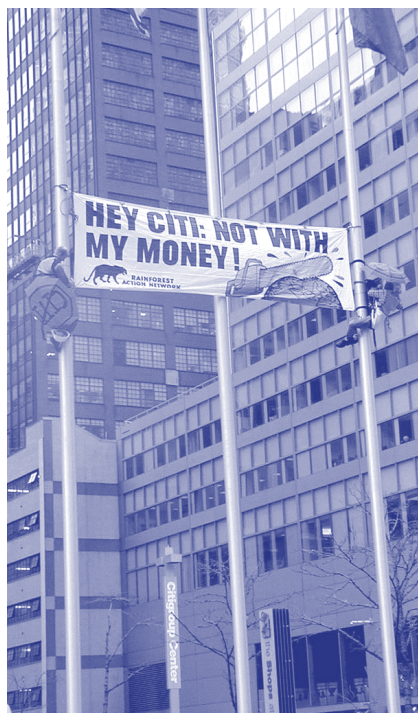
Protest at Citigroup Headquarters New York

"As representatives of the non-governmental organizations (NGOs) that drafted the Collevecchio Declaration calling for environmental and social responsibility from financial institutions, we applaud the