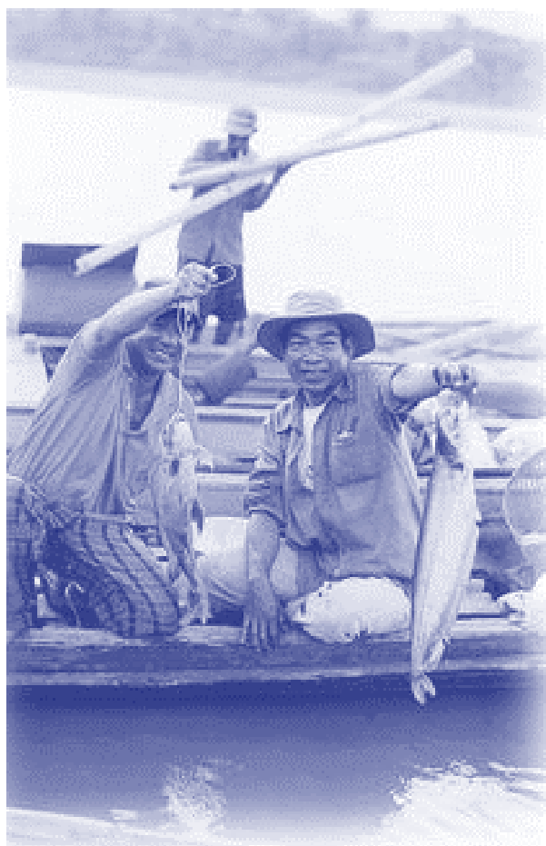
lucky catch, for time being

To finance the project, the Nam Theun 2 Power Company is looking for $850 million of long term project financing, split in equal proportions between Thai Baht and US dollars. In February 2004 a group of nine banks was appointed to arrange the $420 million international project loan, including the following EP signatories: Calyon (France), KBC Bank (Belgium), ING Bank (The Netherlands) and Standard Chartered (United Kingdom). 46 Financing has not been arranged yet, as the World Bank and other multilateral banks and export credit agencies first have to decide if they are prepared to cover some of the risks of the bank loans. Decisions are expected at the end of 2004 or early 2005. 47