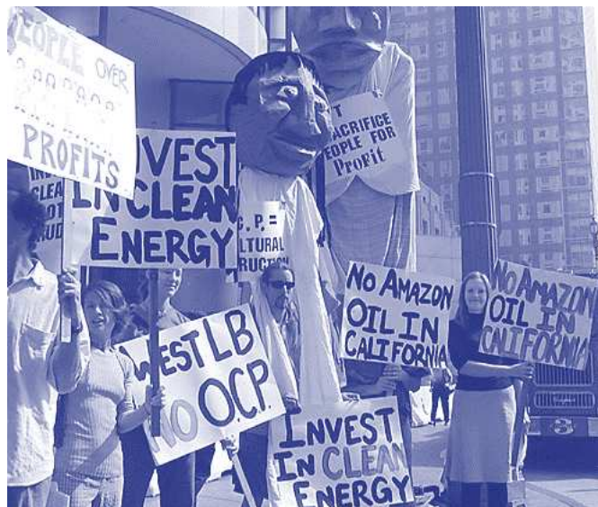
Protesters opposing the OCP pipeline in Ecuador, financed by WestLB

This letter marked a change in the Equator banks' mode of operating: until then the Equator banks had characterized themselves as a loose assembly, but by organizing themselves as a lobby group they clearly signalled not only a new level of coordination, but also a new of set activities around lobbying. The letter, with its obstructionist goal, dealt a significant blow to the integrity of the Principles in the eyes of NGOs. When a draft of the letter was leaked, BankTrack members expressed shock and outrage that the Equator banks would block rather than promote