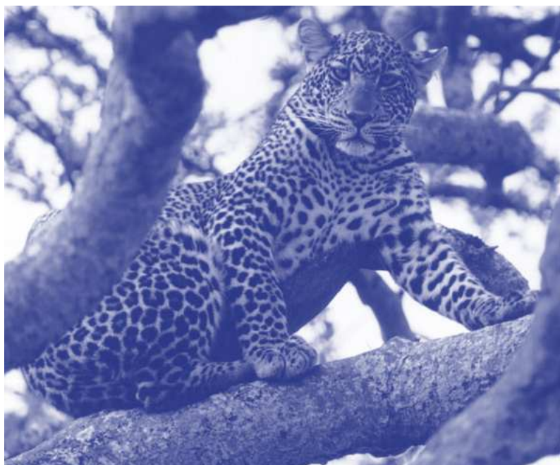
There is a lot at stake; courage required