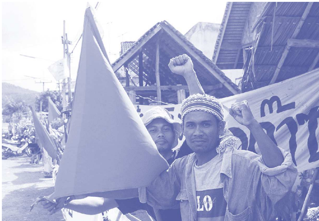
Villagers protesting Trans Thai-Malaysia pipeline

The UN Special Envoy on Human Rights Hina Jilani criticized the government's harassment and intimidation of those using their freedom of expression to protest, creating a "climate of fear"