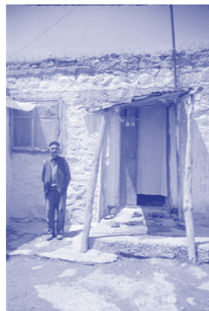
Kurdish village, Eastern Turkey

That trust proved to be misplaced. In February 2004, the Sunday Times newspaper reported that the pipeline had been using an inappropriate weld coating, which risked causing major leakage. The findings came from an international expert in weld coatings, who had worked on the pipeline and advised against using the coating. He wrote to BP, "We are completely out on a limb ... I have witnessed many failures in specifications . . . but the situation on the pipeline is unique in my 41 years' experience. There is no question in my own and many other people's minds that the wrong system has been chosen through a seriously flawed selection programme." 8 Cracks have now appeared in the pipeline coatings, yet arguments continue between BP, financial institutions and contractors over whether wrongly coated sections of pipeline should now be dug up and re-coated.