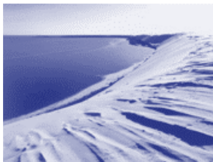
Curonian spit

kilometres from the oil deposit is the Curonian Spit, a narrow strip of sand from 350 metres to four kilometres wide and 92 kilometres long that forms a lagoon along the Baltic Sea coast. The Curonian Spit is a national park in both Russia and Lithuania and was inscribed on the Unesco World Heritage List in 2000. The area has some of the highest sand dunes in Europe and its forests, planted in the 19th century to halt the sand erosion, carry a high level of biodiversity. 15