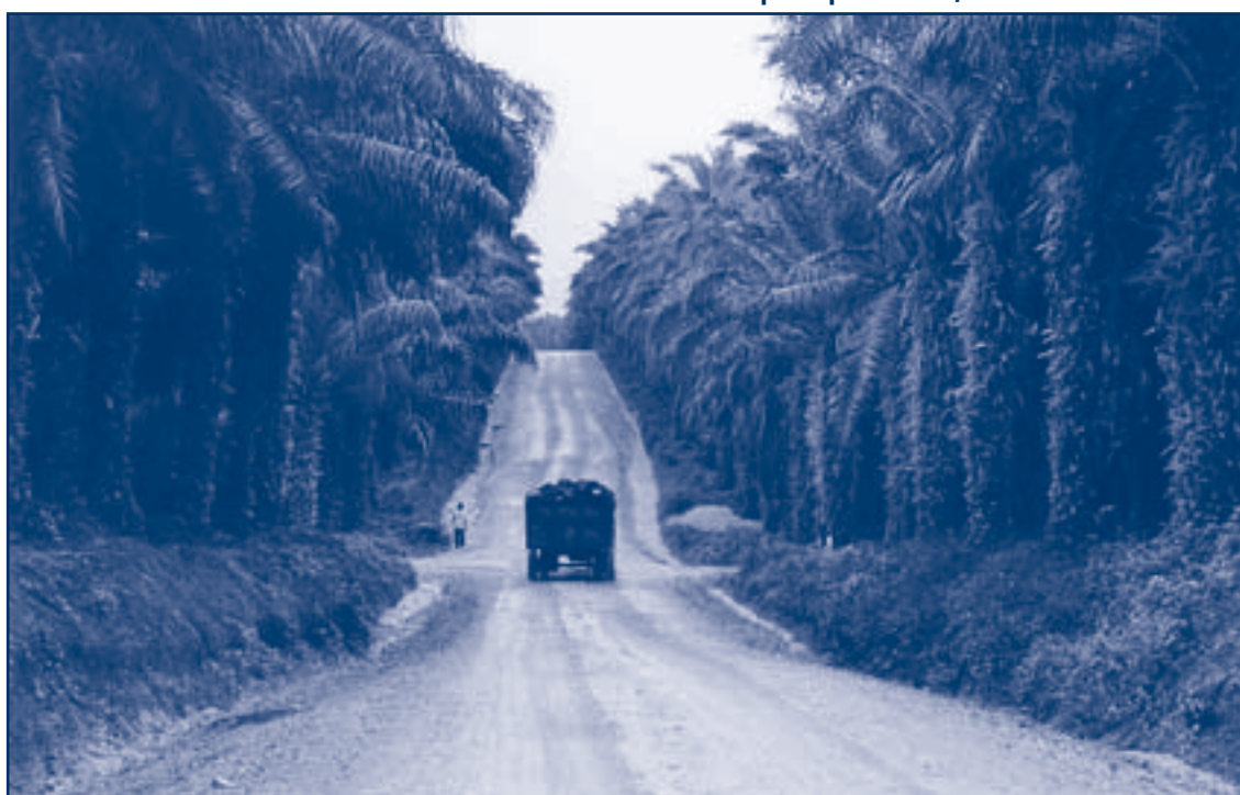
Oil palm plantation, Sumatra