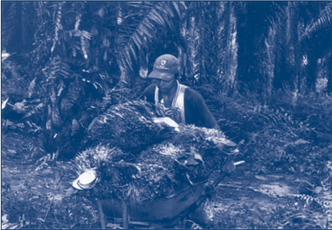
Harvesting fresh fruit bunches

importance. Most banks indicate to have organised some form of training, but not much details are known.