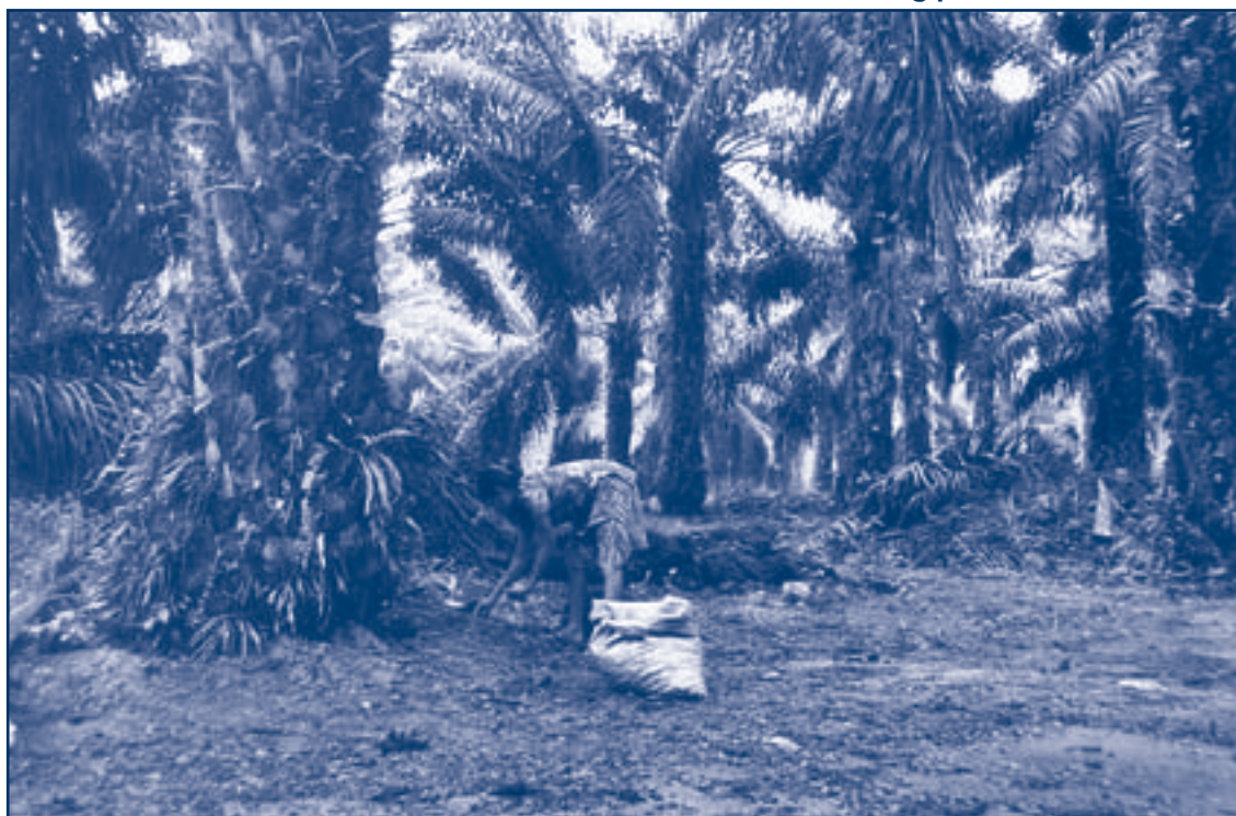
Woman collecting palm fruits