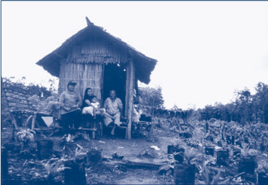
Oil palm nursery, Sumatra

applies to the soybean sector. Similarly, Rabobank's policy applies to Indonesia only, but the bank has verbally stated that its policy also applies to other countries.