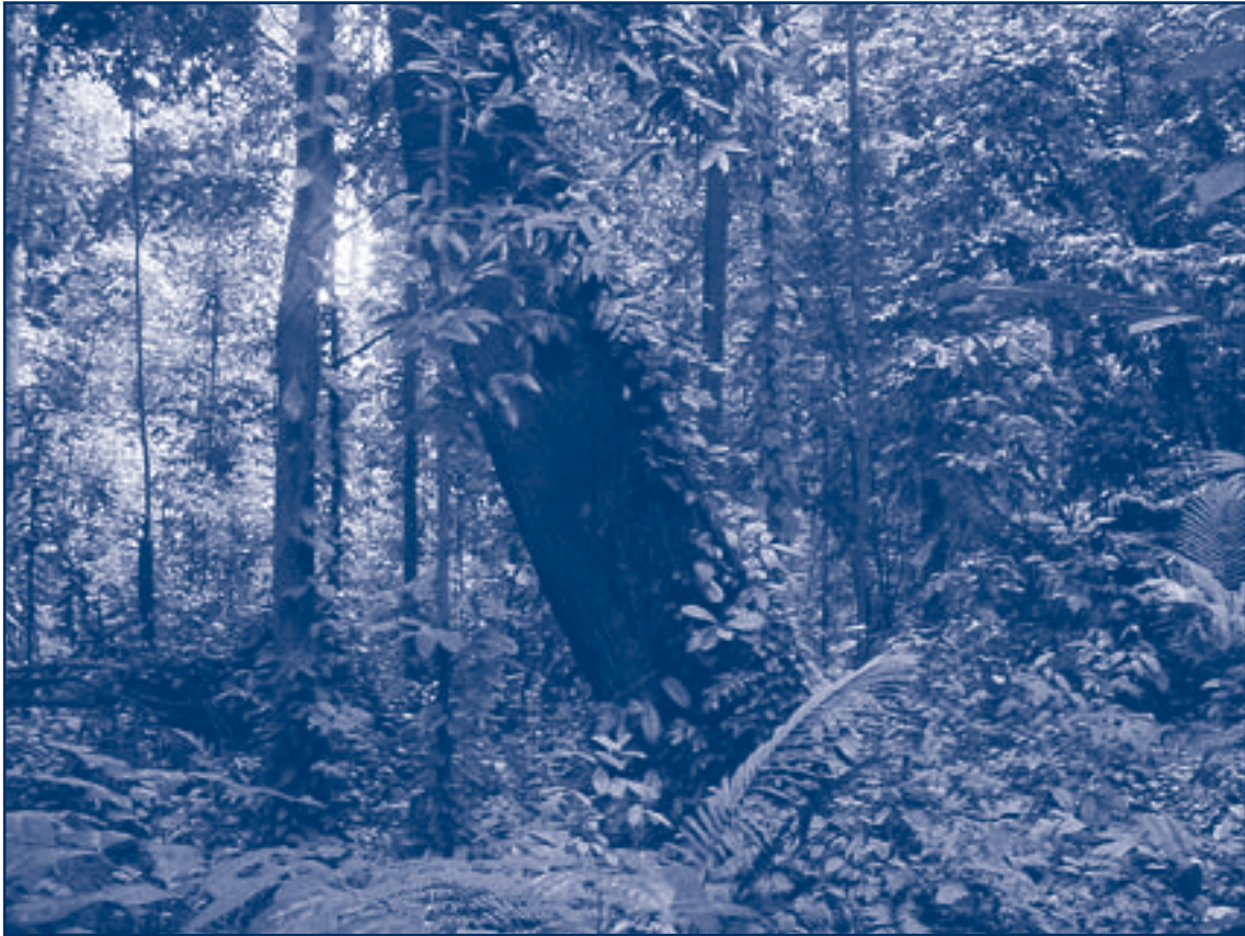
Indonesian tropical forest

value, as it leaves no room for misunderstanding or confusion among the bank's staff, its clients and civil society as a whole. We encountered the following best practices with regard to the four criteria evaluated: