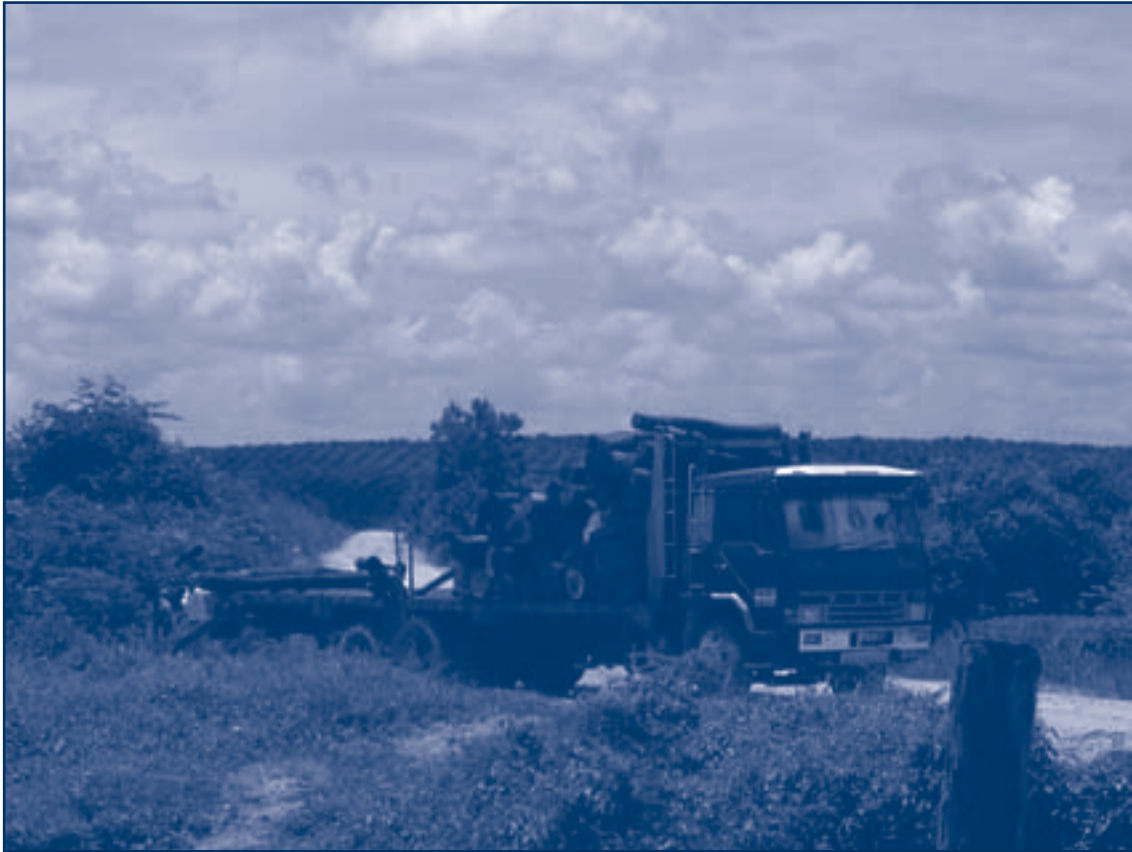
Transport of logs in oil palm plantation