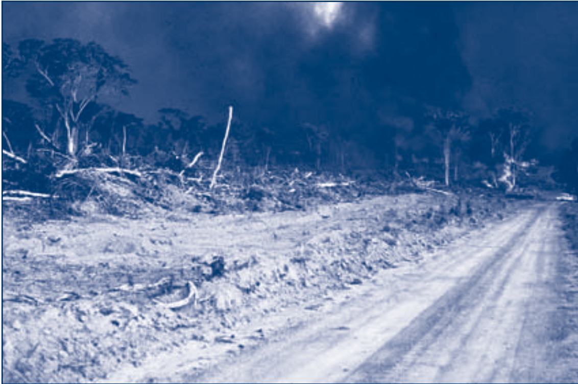
Burning land

Meanwhile, according to media reports in April 2006 ING Bank was again arranging a syndicated two-year US$ 100 million loan for Indofood Sukses Makmur. 76