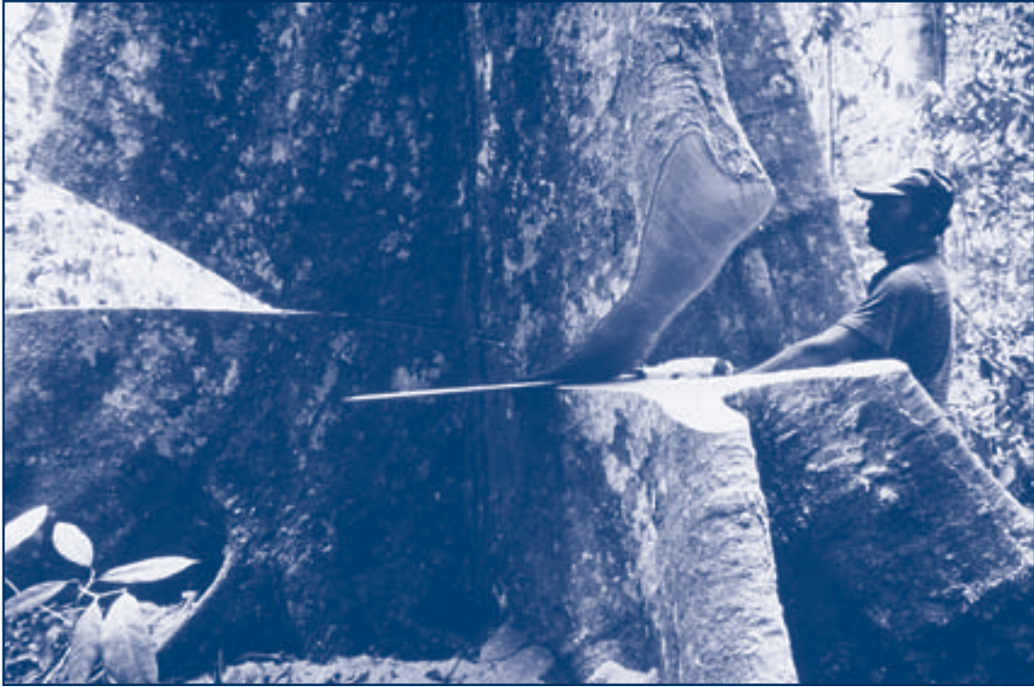
Cutting down a forest giant, Sarawak

In this framework the Dutch government could do the following: