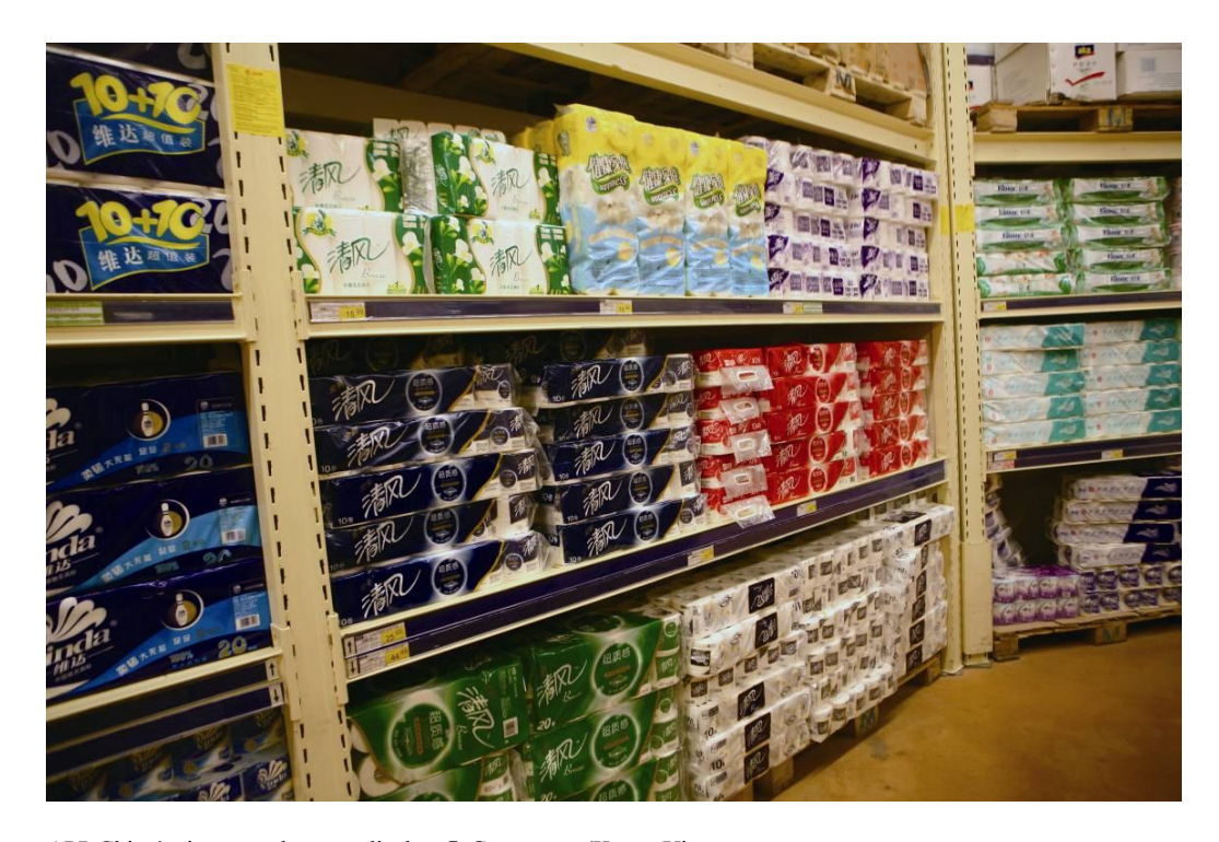
APP China's tissue products on display

In China APP has always been entangled with plantation development issues and has never mentioned that they use materials from sources other than plantations. Further more APP has taken the first place to announce forest procurement policy among Chinese paper manufacturers, and to proclaim that "procurement from virgin forests is forbidden, pulp mills from our supply chain are requested to stop using any identified tropical rainforest species that have a high preservation value"<sup>65</sup>. What's more, the company went even further by announcing "Paper Contract with China" in 2008, in which it clarifies that "in areas we operate, we will seek and provide solutions