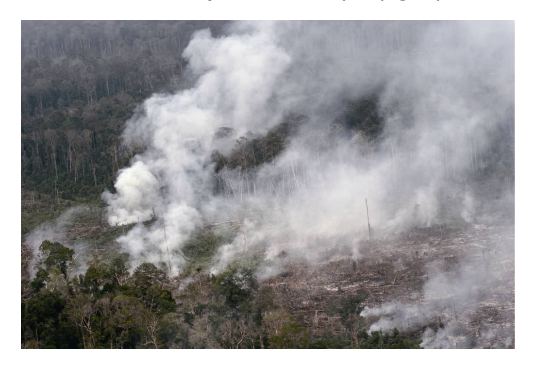
A glimpse of massive pulp plantation owned by international pulp giants APRIL and Sinar Mas APP in Riau, Indonesia