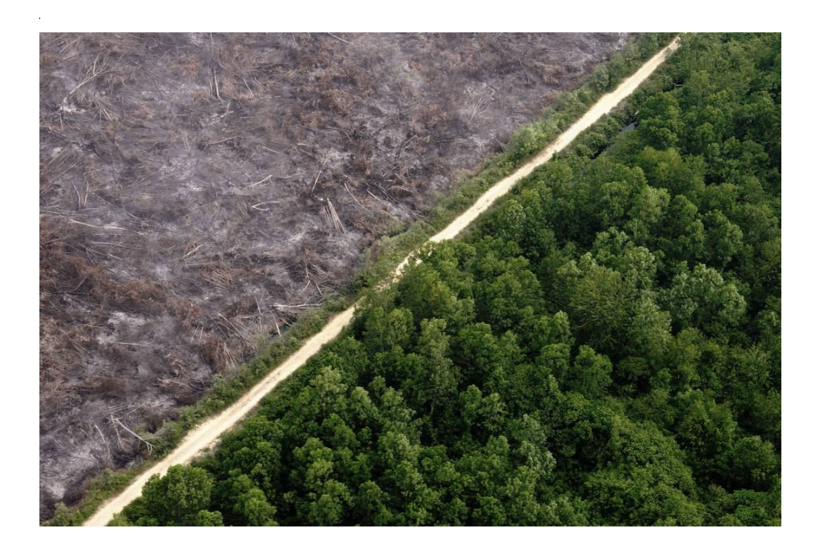
A glimpse of massive pulp plantation owned by international pulp giants APRIL and Sinar Mas APP in Riau, Indonesia