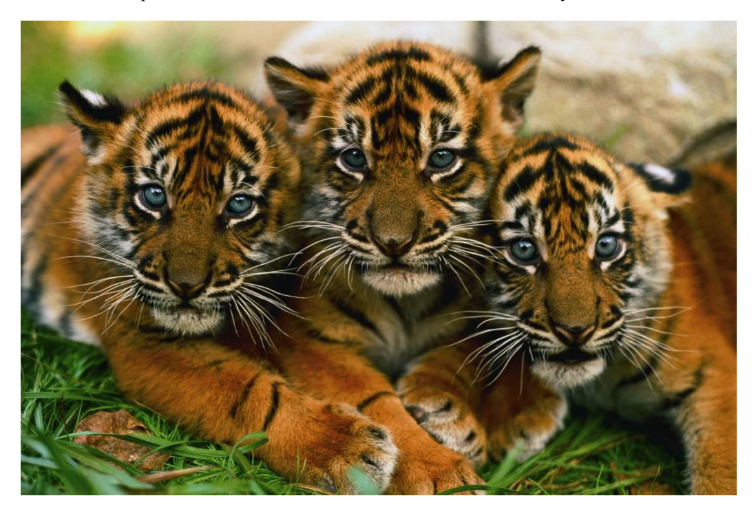
Three Sumantra tiger cubs

overly optimistic figures used by Sinar Mas, this would amount to about 37 tC/ha.<sup>31</sup> However, APP's assumptions would lead to a harvest of over 160 m³/ha³² at the end of a 7 yr rotation cycle. The Ministry of Forestry assumes a harvest of 125 m³/ha in their "road map for the revitalization of Indonesia's forest industry".<sup>33</sup>