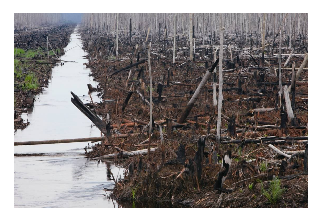
Land clearing site done by APP's subsidiary company Arara Ababi

Sinar Mas acquired PT Indah Kiat Pulp & Paper in 1986<sup>45</sup> and subsequently increased its pulp capacity from around 120 000 tonnes in 1989 to 1.7 million tonnes in 1999. At that time, Sinar Mas' plantation area, however, amounted to only 160,000 hectares supplying APP with 900,000 cubic meters of Acacia were logged<sup>46</sup>. The fibre needs for 1.37 million tonnes, however are 6.7 million cubic meter. That is, Sinar Mas' plantations supplied only some 13.4% of PT Indah Kiats fibre needs at that time<sup>47</sup>. In 1999 IKPP announced that plantations managed by PT. Arara Abadi would be enough to satisfy their needs by 2004<sup>48</sup>. While by 2005, the capacity of IKPP has increased to 2 million tonnes consuming 9.8 million cubic meters of logs, meaning over 59% were sourced from "mixed tropical hard wood pulp, MTH" coming from natural forest<sup>49</sup>. By 2007, according to APP's own publications, the share of natural fibre has decreased to 8%, indicating the massive conversion of Indonesian tropical