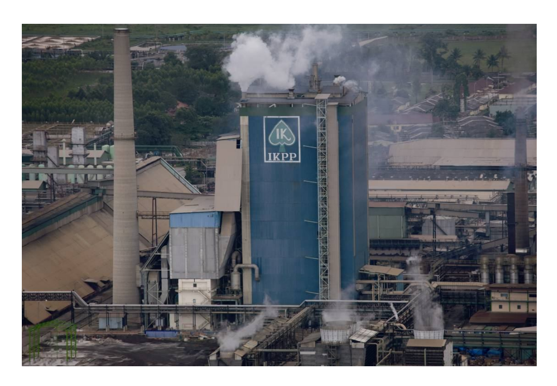
One of Sinar Mas' subsidiaries in Perawang, Indonesia PT Indah Kiat Pulp and Paper