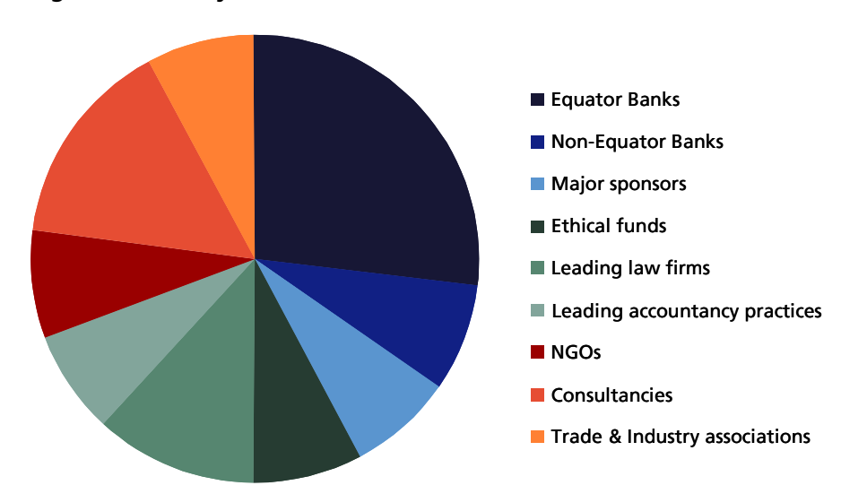
Figure 1 - survey interviewees

Over 40 interviews were held in person or by telephone. Individuals interviewed included senior bankers and officials in Equator Banks and non-Equator Banks and senior officers in public bodies and rating agencies, together with prominent NGO officials, technical consultants, accountants and lawyers.