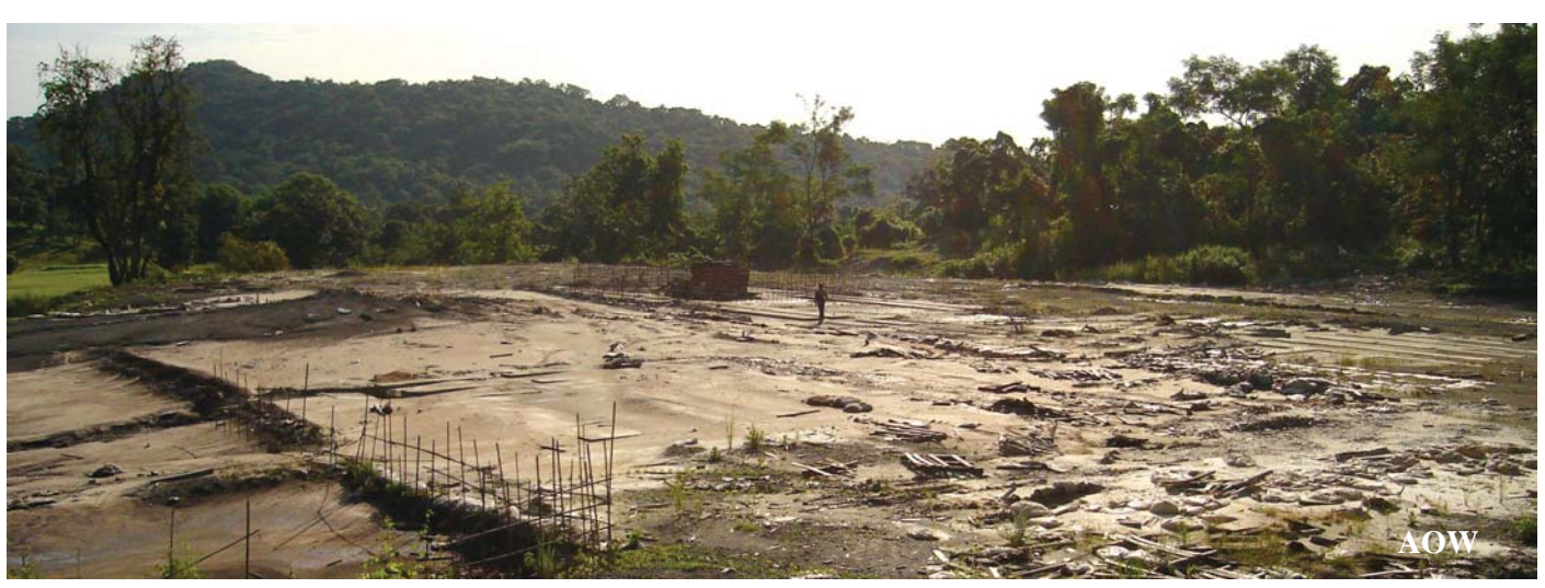
Land that was confiscated for CNOOC's drilling site in Laydaung, Ramree Island.

management, such projects are likely to cause environmental problems, the [CAEP] report said."