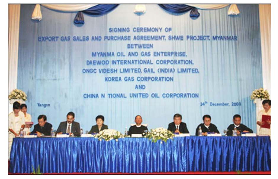
People attend a signing ceremony for a gas sales and purchase agreement with the Shwe Project by the China National United Oil Corporation (CNUOC), Myanmar, and a consortium led by South Korea's Daewoo International in Yangon, Myanmar, Dec. 24.

The news release said, "Daewoo International and the KOGAS have breached and will continue to breach a