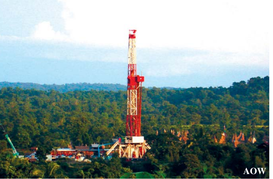
CNOOC's drilling site in Renandaung Village, Kyuk Phyu Township, Ramree Island.

Concerns about the cost of letting China tighten its grip on the natural resources in Myanmar has also been expressed by other groups, including EarthRights International (EI), a US-based group championing human rights. There are 69 Chinese companies involved in 90 "completed, current and planned projects" in the oil, gas