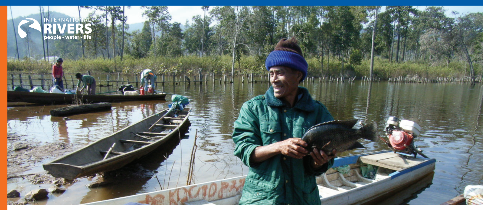
Long term production of the Nakai Plateau's reservoir fishery is in doubt.