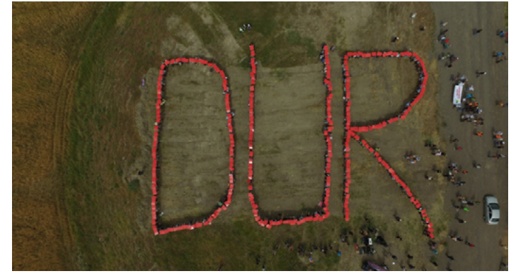
'DUR' – 'STOP' in Turkish – marked out by coal protestors next to a coal ash dam in Aliağa during last May's Break Free action