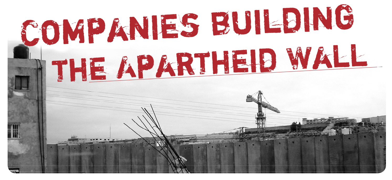
The Palestinian Grassroots Anti-Apartheid Wall Campaign

The Wall and its checkpoints, observation systems, and military roads is the largest infrastructure project carried out by the Occupation authorities to date, requiring a variety of landscapers and planners; suppliers of concrete, fencing and heavy machinery; and other producers of various high-tech equipment. As of 2007, 700 different subcontractors, around 60 planning offices, 53 major construction companies, 5 wire-fence companies, 11 civilian security companies, and about 34 producers of surveillance and communications were on the payroll.<sup>1</sup>